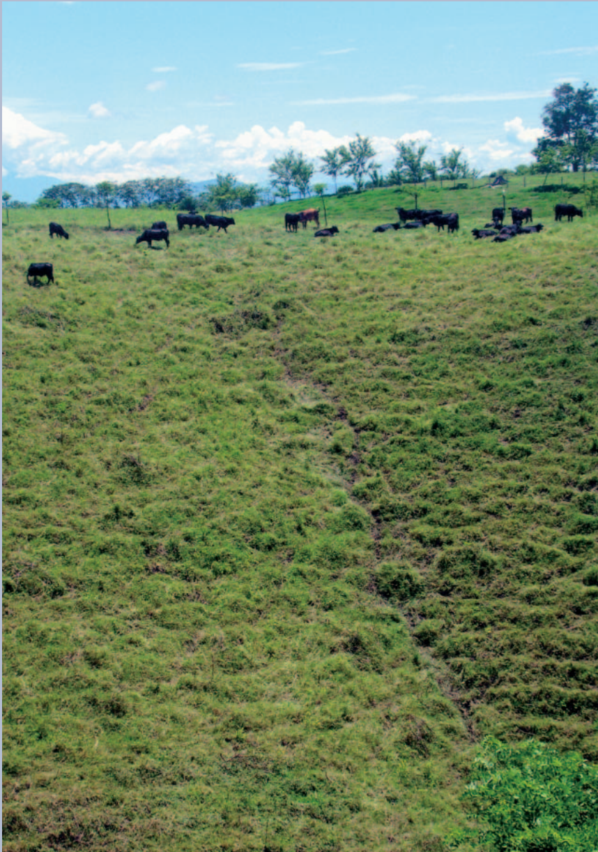
FIGURE 1 Degraded extensive pastures are a common sight in areas such as Quindío, Colombia.