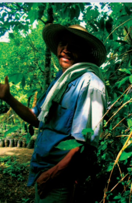
FIGURE 3 A farmer in Colombia's Quindío region with the seedlings he is about to plant on his farm.

ly to be site-specific. As with biodiversity benefits, these benefits will generally not be included in land users' decision-making.