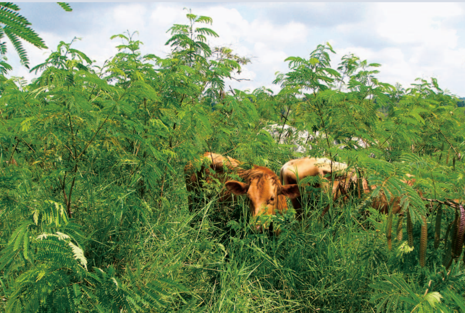
FIGURE 5 Silvopastoral practices introduce a variety of tree species in pasture. Here, cattle graze in an intensive leucaena or leadtree ( Leucaena leucocephala ) system in Quindío, Colombia. Such systems can be more productive and can harbor much higher levels of biodiversity than the extensive pastures they replace. However, high initial costs often make them financially unattractive to land users.

diversity than current monocultural, treeless pastures. Figure 6 shows initial data from biodiversity monitoring at the Costa Rica and Nicaragua sites. These results show that land used under a silvopastoral system harbors higher levels of biodiversity than treeless pastures. The observed diversity of bird species, as well as the number of individuals (not shown in Figure 6), is greater on land with trees, and higher yet when the tree density is higher. Similar results are being obtained for other indicators (vegetation, ants, and butterflies).