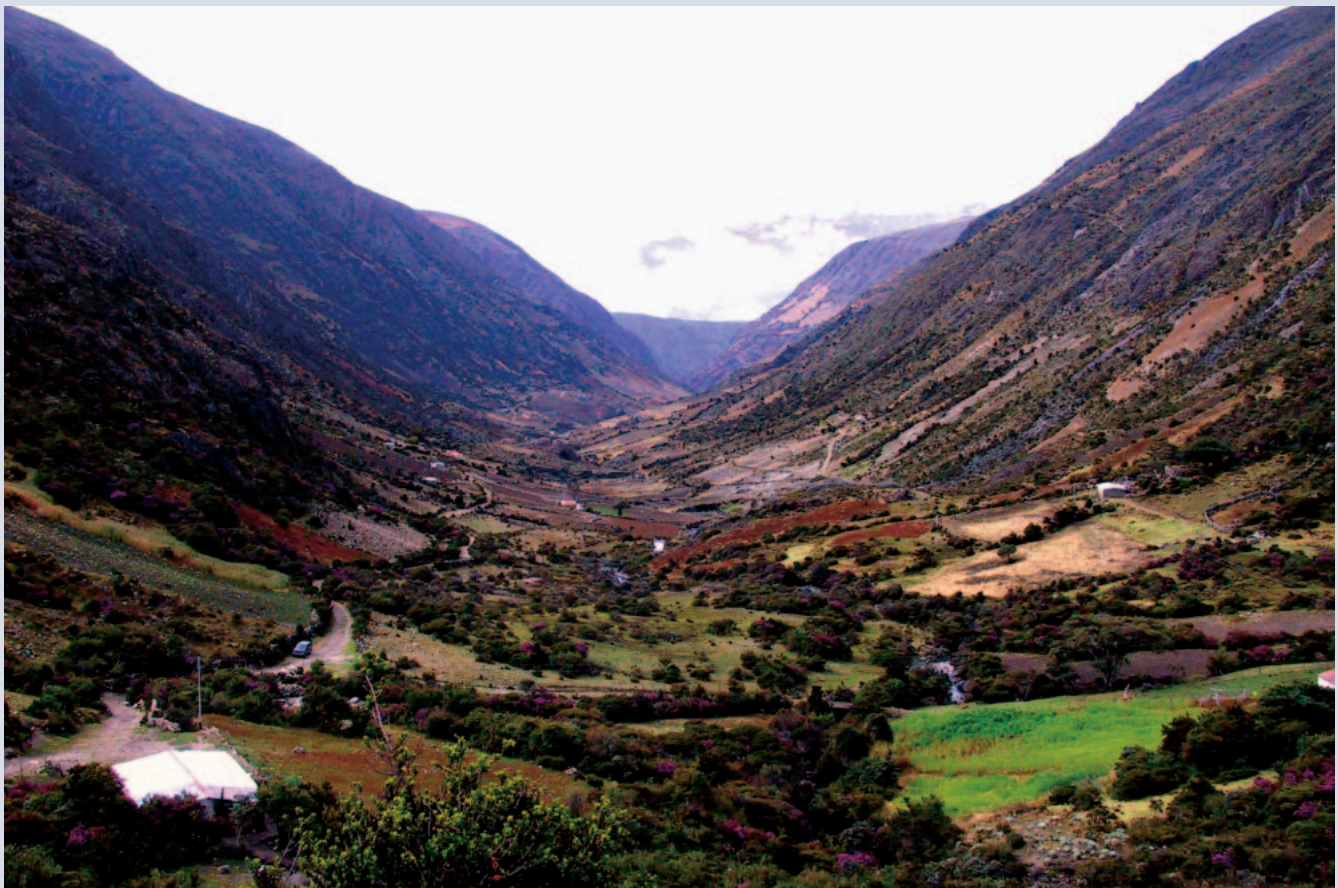
FIGURE 5 Pilot site in Gavidia. Fallow agriculture is practiced to cultivate potatoes. The agricultural zone occupies 19% of the total area (6030 ha) between 3200–4200 m. The 400 inhabitants also depend on extensive cattle raising; some derive their income from tourism. The dominant vegetation is a rosette-shrubland páramo.