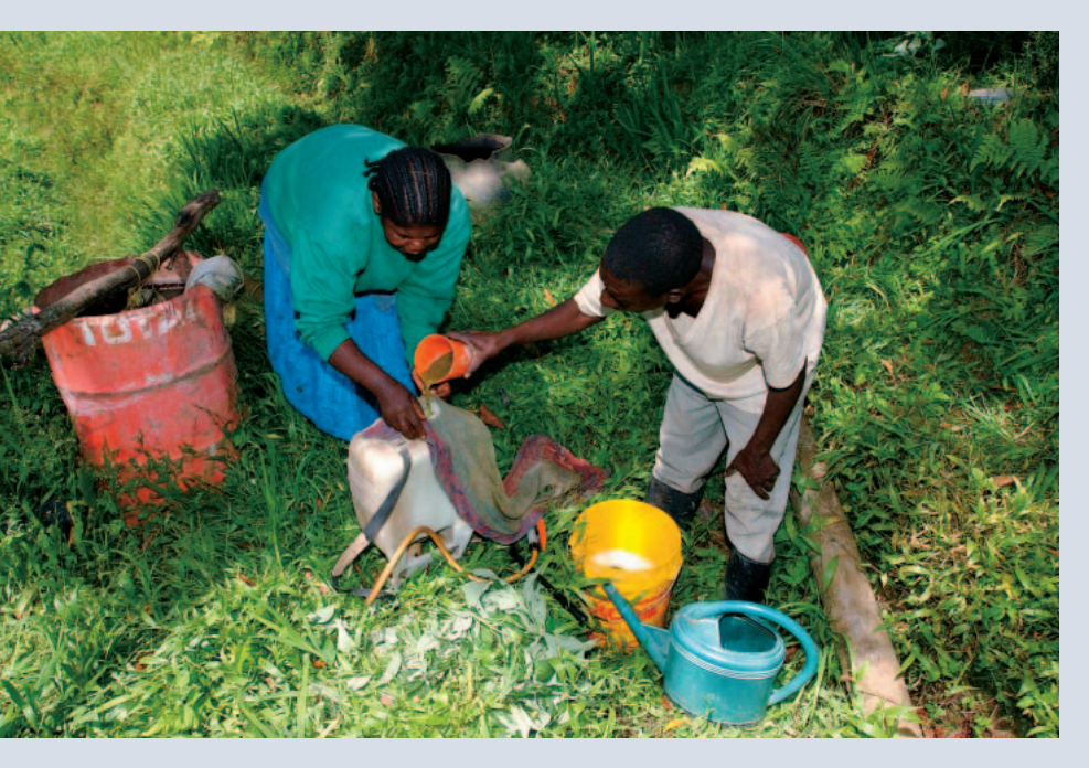
FIGURE 3 Farmers preparing a local pesticide from leaves and stems of selected plants to spray on vegetables in Mgeta village, Morogoro region, Tanzania.

eat the seeds that they planned to keep for the next planting season. However, without seed there will be no crop, and the cycle of seed recycling as well as closely related knowledge will be endangered. Other risk factors are outside influences on rural communities that lead to changed interests and attitudes on the part of the younger generation. The example of the disappearance of the castor oil crop from some of the Southern Highland villages highlights how fragile these systems are.