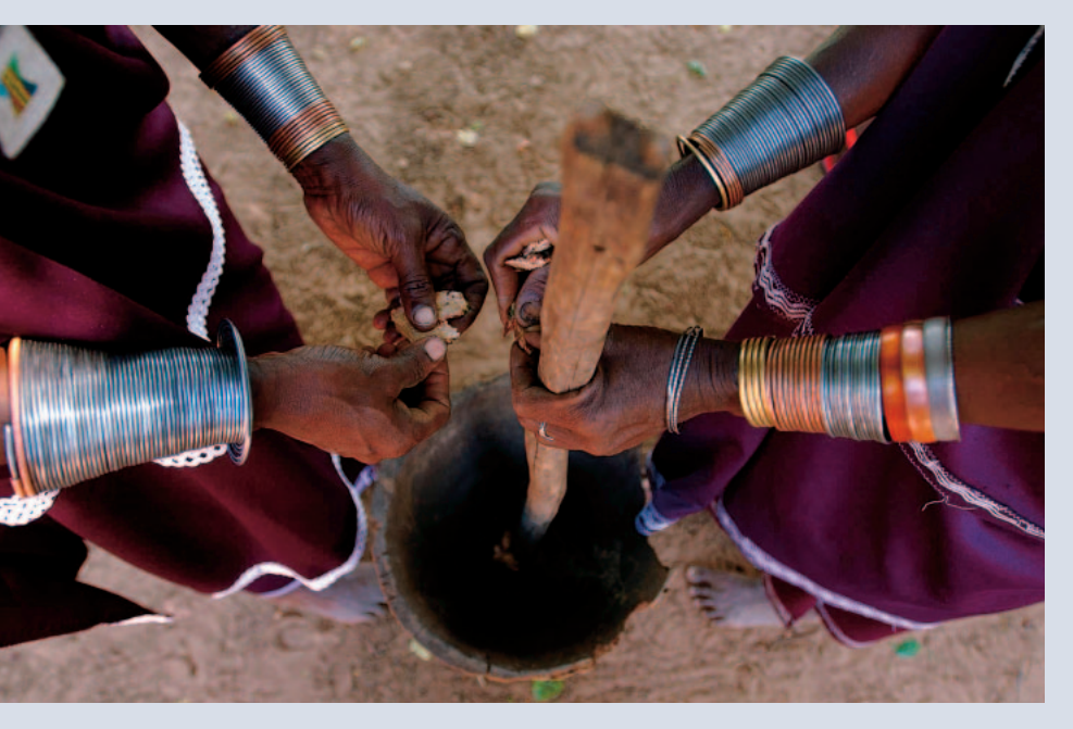
FIGURE 5 Women and men farmers have an enormous wealth of knowledge about how to treat their animals with medicine made of local plants. Pieces of mkunde kunde bark are pounded into a powder and mixed with water to cure animals of infestation with worms.

"We hope the next generation will integrate the best of the modern with the best of tradition." (Masaai herder)