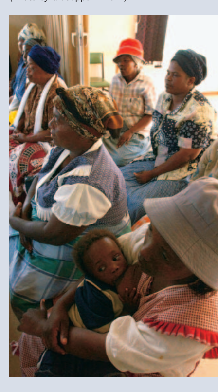
FIGURE 4 Women participating in a workshop discuss local seed varieties.

Due to workshops and intensive collaboration between many national partner institutions, an increasing interest in local knowledge was observed in Tanzania. Based on a stakeholder workshop, several institutions—the Commission for Science and Technology (COSTECH), the Tanzania Food and Nutrition Centre (TFNC), the National Environment Management Commission (NEMC), the University of Dar es Salaam, and the National Institute of Medical Research (NIMR)—formed a