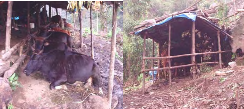
Fig. 2 Temporary housing of cattle at the village farms Breeding management

Most farms (67 percent) had temporary housing for adult cattle and calves made of wooden poles, singles (crudely-made planks) with bamboo mat and plastic sheet for roofing. Sixteen percent had semi-permanent houses made of roughly finished timber, with stone or plank flooring. Rooves were made of bamboo mat or banana leaf, which were invariably covered with plastic sheet (Fig. 2). The external plastic sheets were clamped with poles, tree branches and stones. Seventeen percent of farms did not have housing for adult cattle but had temporary sheds for calves.