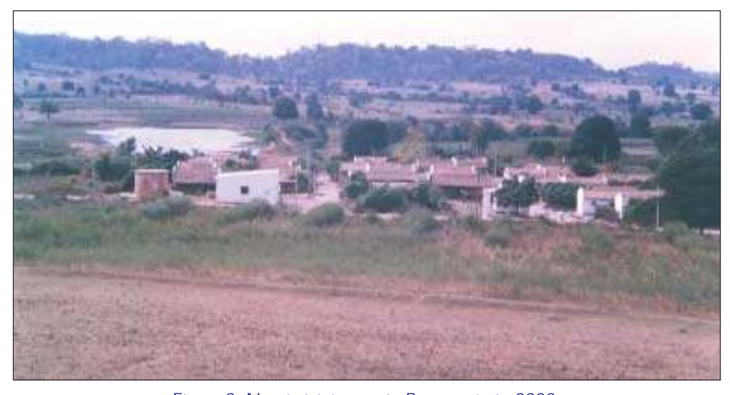
Figure 8. New brick houses in Powerguda in 2003. (Note: The houses were built by local residents by combining their own funds with government grants indicating a level of self-confidence and financial maturity.)