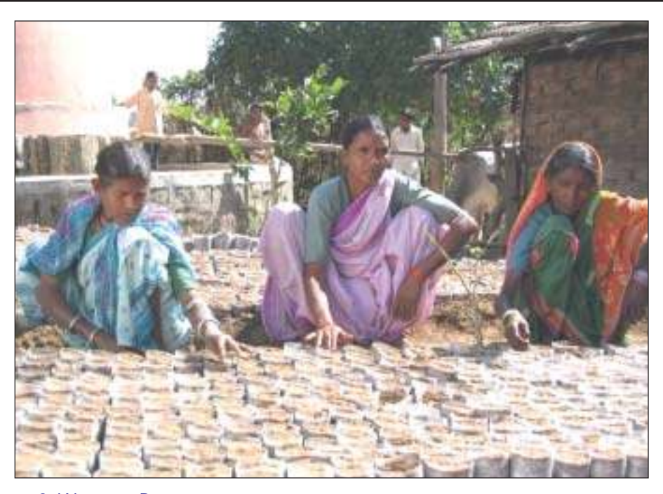
Figure 6. Women of Powerguda prepare polyurethane bags to establish pongamia saplings. (Note: The pongamia nursery has become a new income-generating activity in the village.)

10,000 are to be planted on community land and the rest sold to nearby villages and to the forest department. The proceeds from the sale will be plowed back into the nursery investment. With the formation of a forest protection committee [Vana Samarakshana Samithi (VSS)] recently, public investment in the local forest is expected to increase and the local nursery will remain a viable business.