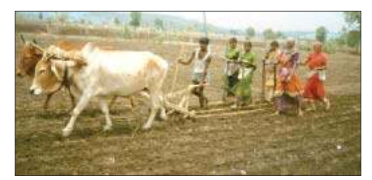
Figure 2. Farmers use a traditional method of planting in which seeds and fertilizer are mixed together.