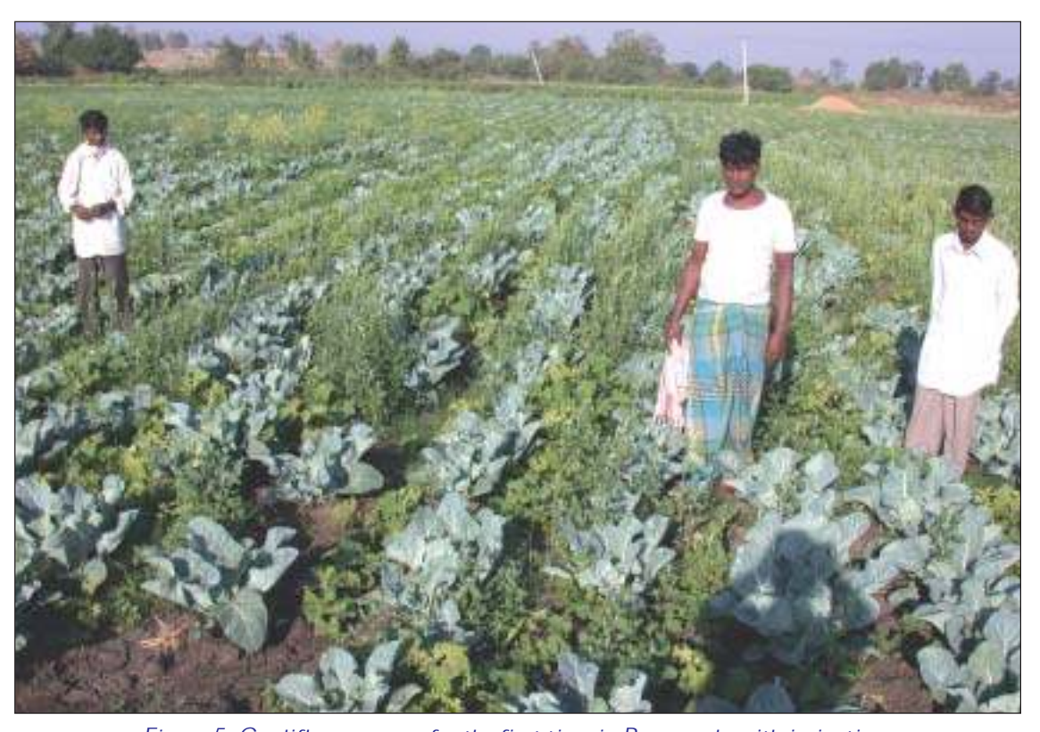
Figure 5. Cauliflower grown for the first time in Powerguda with irrigation.