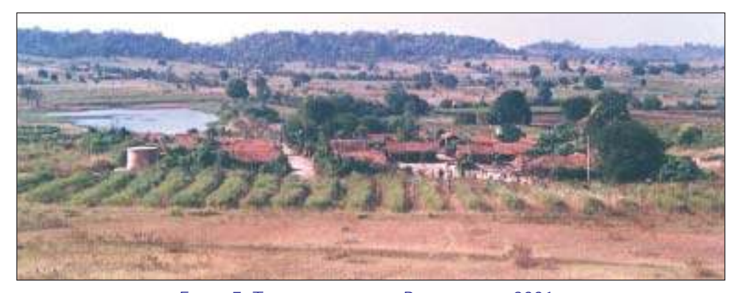
Figure 7. Thatched houses in Powerguda in 2001.