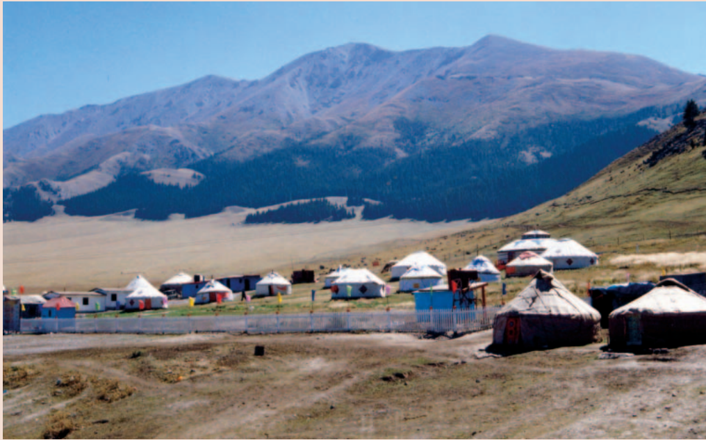
FIGURE 5 More sustainable tourist accommodations built by local people near Sayram Lake, in the Tien Shan; there are no permanent structures around the lake. Damage to the ground from tourist use can be repaired.

stand the significance of protecting world heritage sites and parks in mountains. Specialists, eg Xie Ninggao (Peking University) and Li Jisheng (Shandong Province), have revealed the problems of over-urbanization and landscape damage in mountains, and appealed for measures and actions to halt careless behavior. International pressure has forced some local governments to invest large sums to remove hotels and even local residents from scenic spots. In some areas, more sustainable tourism has been initiated (Figure 5).