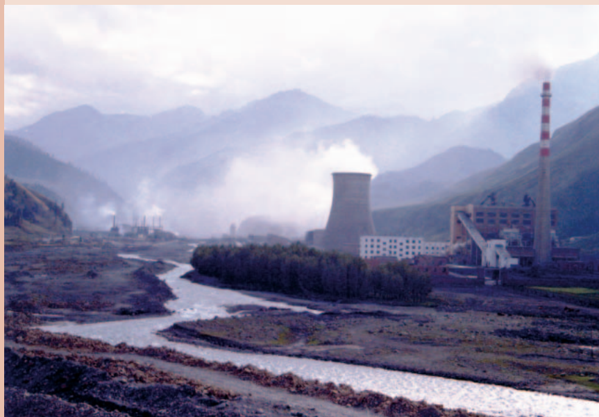
FIGURE 1 Cement plant built in the early 1970s in the mountains south of Urumqi, Xinjiang. The plant provided more than 300 local jobs but is the source of uncontrolled pollution. Distance from the city means there is lack of awareness of this negative impact.

The urbanization process has brought many problems. One is the emergence of landless peasants—a rapidly expanding and weak social group. Indeed, large-scale urbanization has led to confiscation of large areas of farmland. Although local governments have occasionally provided some compensation, the amount is usually very limited. In some cases, land was the farmers' only source of livelihood; they have become homeless, jobless, and in some cases have lost hope. Another problem is the helplessness of many peasants who leave their home towns in search of casual labor in the cities, but with almost no assurance of income and decent health. These people are the victims of urbanization.