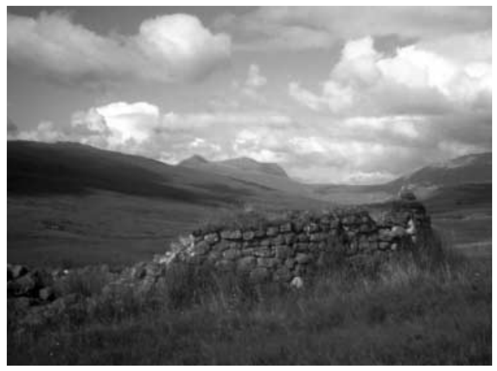
Though the tallest mountain – Ben Nevis – is 1,343 metres, these Scottish highlands are beloved and respected by Scots mountaineers.

Becoming widely accepted, and used by the United Nations Environment Programme-World Conservation Monitoring Centre (UNEP-WCMC), is a system devised by Kapos et al. in 2000.<sup>1</sup> For our general purposes, let us label as mountains or highlands, those steep-sided, three-dimensional earth features that are conspicuous in the landscape, have more than one altitudinal vegetation zone, and are regarded as mountains by local people.