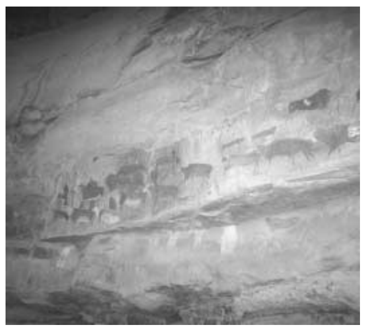
Elements of the San culture are revealed in secretive cave shelters in the Drakensbergs (South Africa), and must be carefully and sensitively interpreted to visitors.

The interpretation of sacred sites must be done with particular sensitivity. For many of the world's people, religions are based on nature gods and goddesses that provide an overriding system of order – a cosmos – which includes all environments from mountains to the seas; "spirituality" is considered to be inherent in all natural things. Such a comprehensive approach to sacred values may provide a broad framework for giving special protection to very many specific elements of the MtPA.