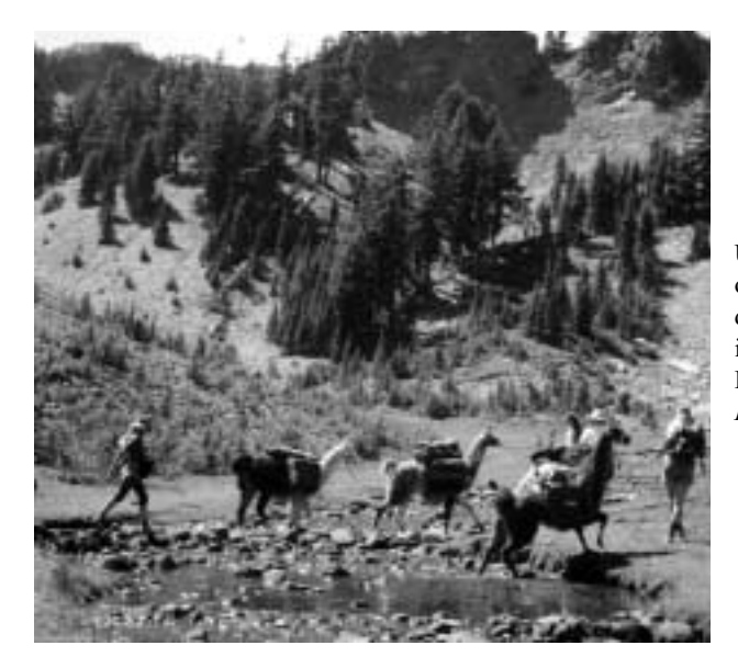
Use of llamas as pack animals instead of hoofed animals like horses, donkeys or mules helps to minimize impacts on trails, soils and vegetation. Llamas have padded feet like camels.

safe and high quality experience. Similar principles apply where the use of horses, donkeys, llamas, yaks or other riding or pack animals or mountain bikes are permitted and used. Whenever possible, riders/packers and walkers should not be forced to share the same path. This provides a safer and more pleasant experience for all.