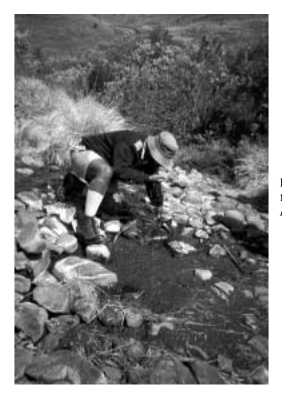
Potable mountain springs should be protected from contamination to benefit PA users.

1. Protected area management must provide safe, high quality water to visitors. Source areas should be identified and protected from other developments that would impair the quantity or quality of the water. Particular attention should be paid to groundwater sources and to maintaining mountain springs for use in more remote areas or piping to lower elevations.