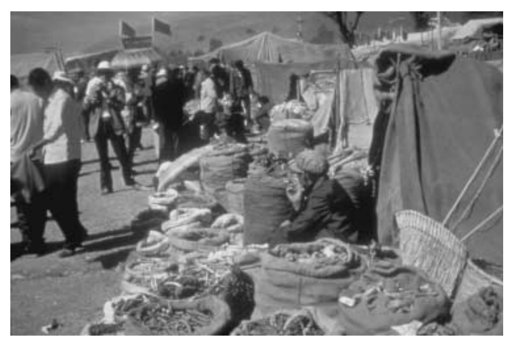
Market at Dali, Yunnan, China where mountain tribal peoples brought 550 different species of plant and animal products harvested from the mountains.

The preservation of the full range of biodiversity and of physical features is an essential element in the selection of mountain protected areas. As an integral part of planning, provision should be made for the protection of large examples of natural ecosystems and of populations of plant and animal species, together with sites illustrating the principal geological and physiographic features and the processes at work in the landscape. These should be supplemented by the protection of a larger number of small areas representing the full local variety of species and ecosystems, including intra-specific genotypic variation.