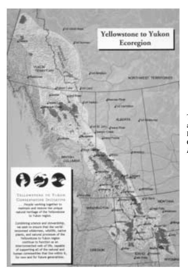
The Yellowstone-to-Yukon Initiative is attempting to connect PAs along the Rocky Mountains in a Conservation Corridor of some 3200 kilometres. Illustration: The Y-2-Y Coalition

connectivity with other PAs or areas of natural habitats. Regulating land or water use or promoting land stewardship in the areas between reserves can supplement the conservation estate and maintain natural corridors.