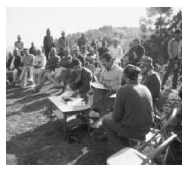
A community consultation in Nepal to solicit input on proposed new management procedures.

Mountain protected areas which contain people may aim to protect not only natural features but also the essential elements of the cultural landscape, archaeological and historical monuments and vernacular buildings. They should provide a framework in which this can be done by encouraging sympathetic economic development which preserves the cultural identity of the resident communities who live in or near the protected area. Although the overriding goal for mountain protected areas should be biodiversity, water conservation and the maintenance of landscapes and wild lands, an essential and integral part of this goal must be recognition that the knowledge, rights, lifestyles and cultural values of people living in and near mountain protected areas.