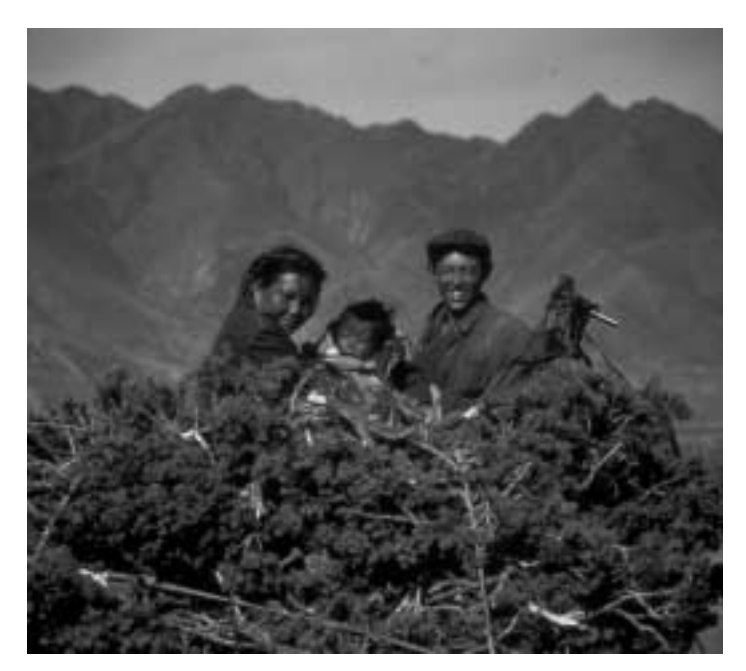
Mountain people have a pride and love for their mountains, and can be valuable allies in supporting mountain protected areas.

Very few, if any, of these communities are not influenced to some extent by the world outside and this influence is bound to increase, through improved access and communications, health care, education, new technology, visitors from outside and the return of local people who have seen other places. "Change" is the order of the day. Improved communications, which are an inevitable result of development, can in time lead to out-migration (especially of the young) and a breakdown of the social fabric. Mountain protected areas can provide a legal and administrative framework within which communities may develop in an appropriate and controlled manner, while maintaining essential elements of their special cultures.