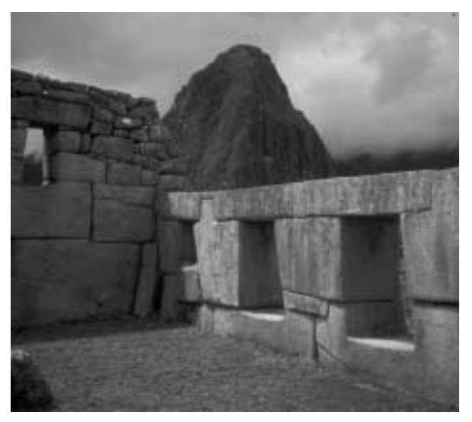
The Historic Sanctuary of Machu Picchu (Peru) was built amid spectacular mountains by the Incas, and is both a Natural and a Cultural World Heritage Site.

5. Special measures may be needed at sites of pilgrimage to reconcile the number of visitors with the quality of their experience and to provide for sightseeing by other tourists without disturbing the pilgrims. If there are problems, it may be necessary to limit access, such as in areas in which the number or timing of visitors is controlled, or in areas where visitors are excluded.