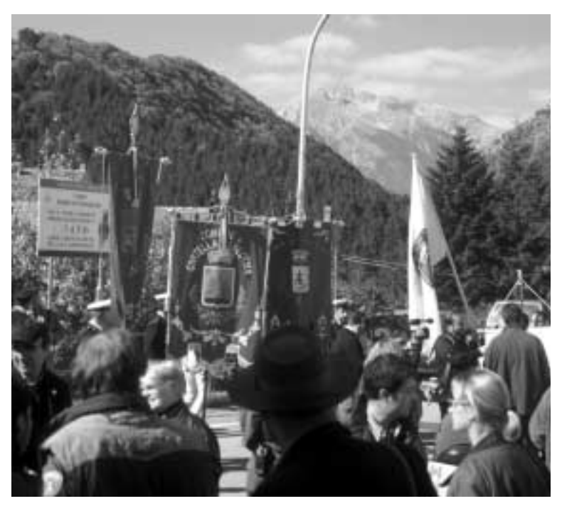
A cultural community festival, sponsored by Abruzzo NP (Italy).