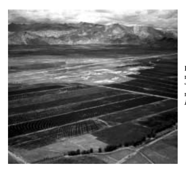
Dryland irrigation from Karakoram mountain water. It has been said: "Without mountain water, there would be no viable Pakistan".

The quality and total yield, and, to some extent, the timing of water delivered to the lowlands and its communities is influenced by land use in the mountain headwaters of the catchments. Undisturbed natural vegetation represents a status quo condition for delivery in quantity, timing and quality, to which the downstream environment and society have become adjusted. The alteration of vegetation through human activity and changed land use usually increases erosion and thus water-transported sediment. Heavy sediment loads and deposition have a host of consequences, most of them causing harm to aquatic life and to the human use of water and causing flooding, changes in the stream and river regime and ultimately the marine environment. Quantity and timing are also changed and therefore environments and life, both human and wild, must adjust; this often entails some cost, such as less total water, more total water, or seasonal changes in quality. Human use of land which adds fertilizers, pesticides or other wastes also creates problems and contributes to environmental change downstream. Natural protected areas, or human use areas where practices are water-quality sensitive, are the safest for water resources.