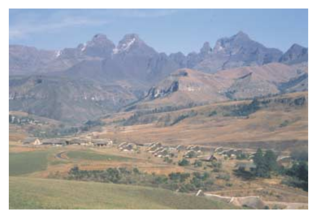
South Africa's uKhahlamba-Drakensberg World Heritage Site, showing Didima Camp where workshop was held.