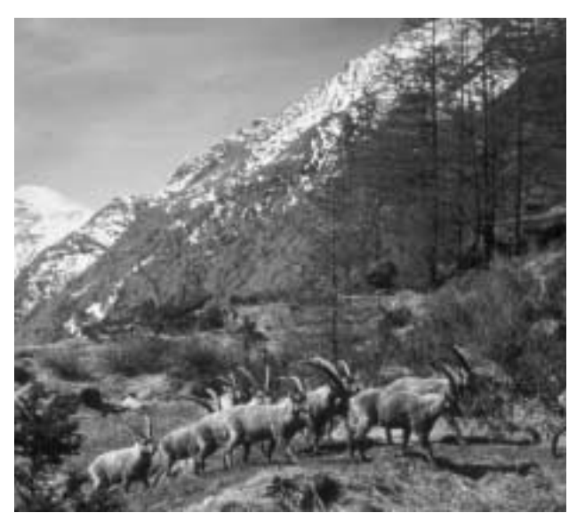
Transboundary co-operation between Gran Paradiso (Italy) and La Vanoise (France) enabled the recovery of the threatened ibex population which requires summer and winter range on opposite sides of the frontier.

1. Mountain regions are the habitats for a number of species which occur in low densities with wide-ranging movement patterns e.g. snow leopards, bearded vultures, jaguars, argali sheep, harpy eagles, black-necked cranes, etc.. Such species often have seasonal movement patterns that cross political boundaries in mountains and need to be managed jointly or with great collaboration. The diversity and complementary nature of these habitat requirements across borders requires that a landscape level approach to conservation management be undertaken, with adjacent jurisdictions recognising their essential and complementary roles to maintain access to habitats at different times/places and to harmonize management regimes.