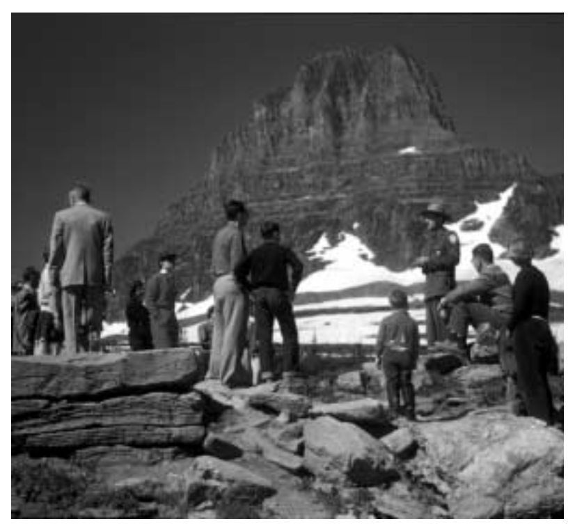
Educational guided walk for visitors to Glacier NP (USA) by Interpretive Naturalist.

Good education and interpretation require specialist skills, should be based on solid evidence and research and should engage the minds and spirits of the audience. Education and interpretation should be socially equitable in its content and delivery.