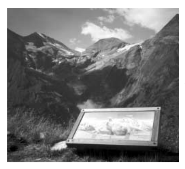
Sturdy, informative panel explaining glacial phenomena at Hohe Tauern NP (Austria).