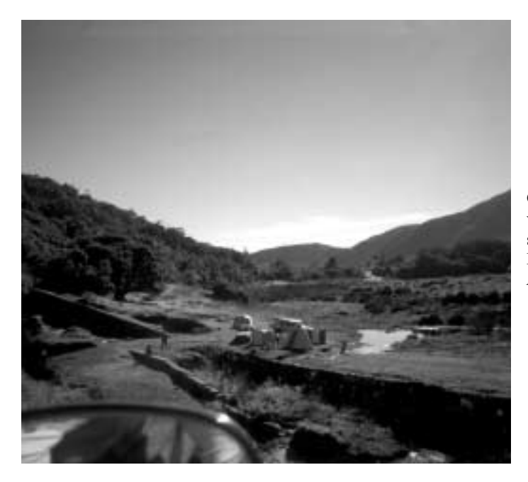
Camping sites at upper elevations need to be carefully sited and regulated, as here in Brazil's Itatiaia NP.

mountaineers and boulderers. However, these groups often have strong traditional "leave no trace" ethics, so can be engaged proactively and positively by land managers to be in effect "self-managed". In cases where such groups have formally established 'protocols', guidelines or internal regulation, it may be expedient for the management plan to simply recognise and manage to these protocols for all practitioners of the particular activity, whether members of the body or not.