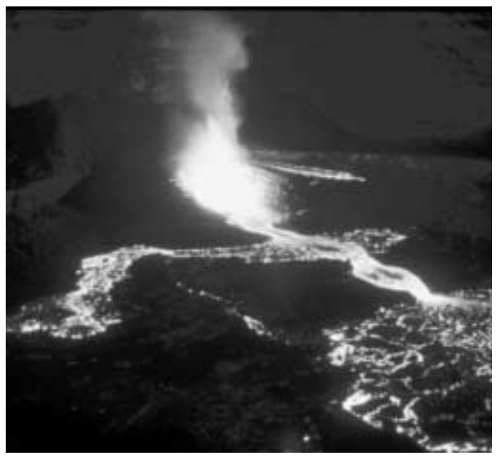
Periodic and well-monitored volcanic eruptions characterise Hawai'i Volcanoes National Park, Biosphere Reserve and World Heritage Site. The volcano is the current abode of the Hawaiian goddess Pele.