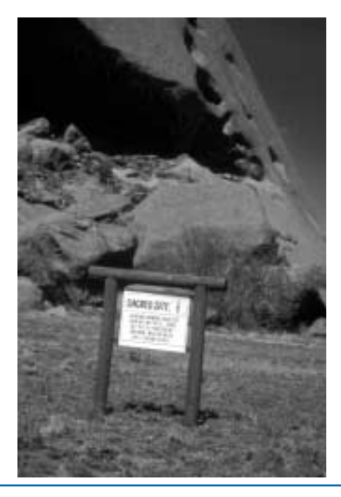
Some sacred places need to be closed to visitation or be carefully regulated. A site reserved for aboriginal women in Australia.

The interpretation of sacred sites must be particularly sensitive. For many of the world's people, religions are based on nature gods and goddesses that provide an overriding system of order – a cosmos – which includes all environments from mountains to the seas: "spirituality" is considered to be inherent in all natural things. Such an approach may provide a broad framework in which may fit the specifics of particular sites, and documentation of beliefs, as appropriate.