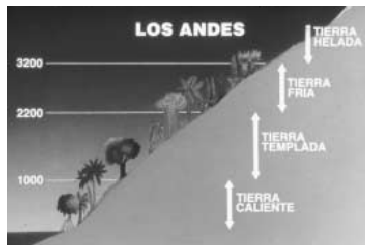
Altitudinal life zones within short distances give mountains a greater heterogeneity for habitats for biodiversity than flatter terrain.

The maintenance of biodiversity transcends the boundaries of protected areas. Many species within protected areas depend on resources outside them and the existence of the protected area likewise affects areas outside.