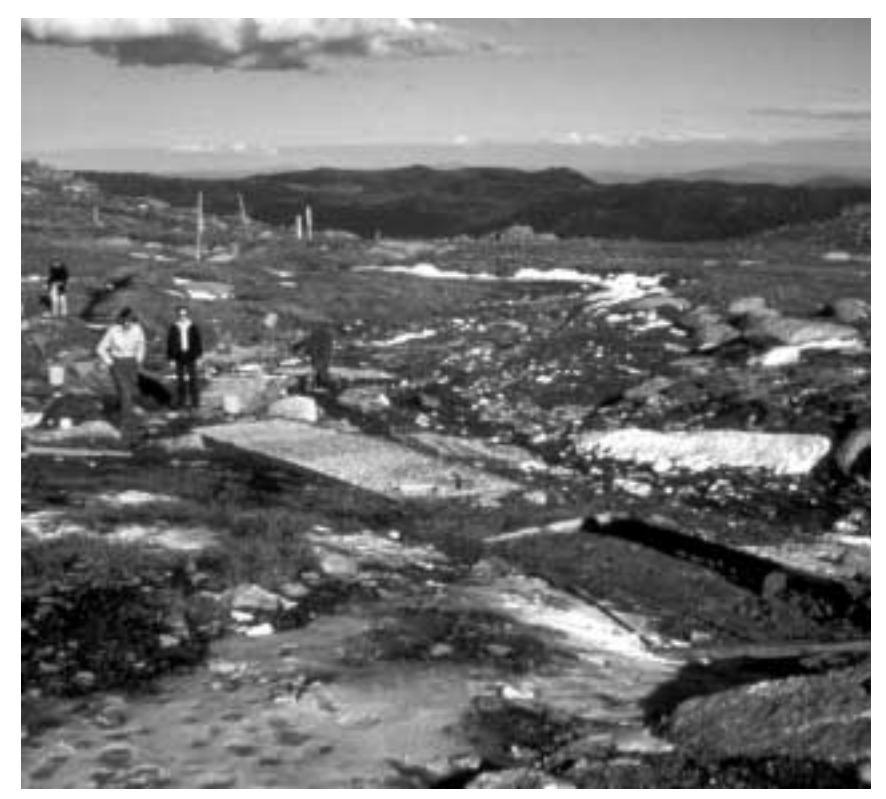
Damaged alpine area being restored in Australian Alps NPs.