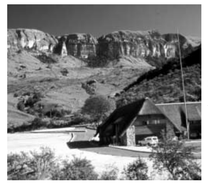
A well-designed entrance and visitor information centre at Royal Natal NP, South Africa.