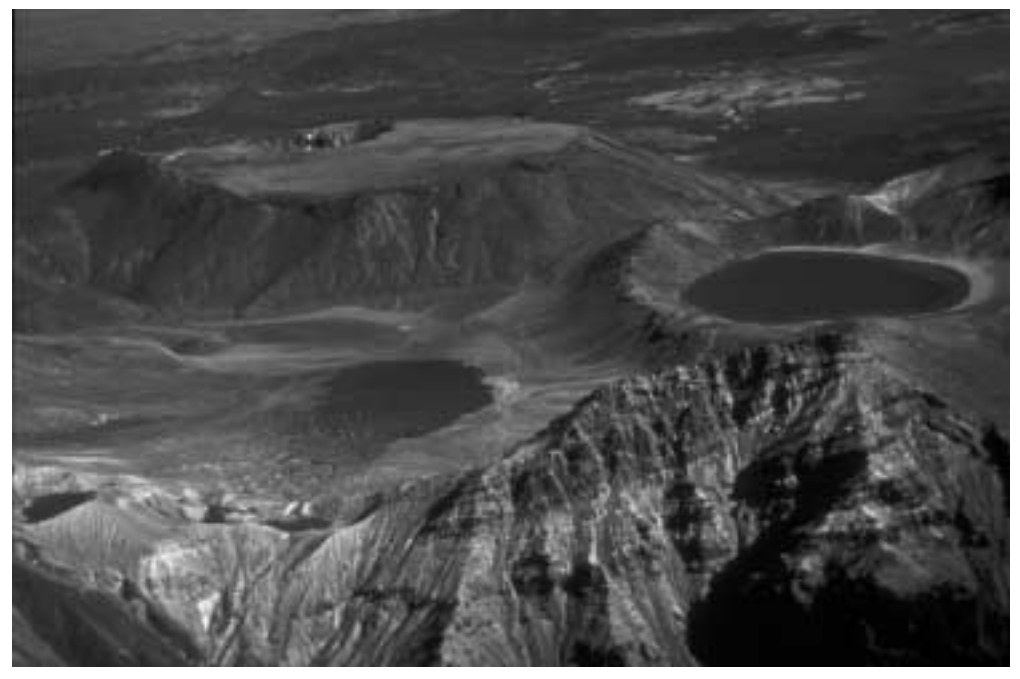
The active volcanic crater of Ngauruhoe and all of Tongariro NP is the most revered and powerful of all of the sacred mountains of the Maoris. It was given by them, in trust, to the New Zealand people to be protected forever. It is both a Natural and Cultural World Heritage Site.

selecting management staff primarily from the local people, or those for whom the place has special meaning and giving them the necessary training to deal with the usual aspects of management.