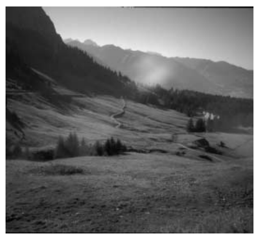
Entlebuch Biosphere Reserve in Switzerland is a Category V Protected Landscape.

little-disturbed natural ecosystems of mountains offer unique opportunities for benchmark research and monitoring as global change occurs. But the whole concept of protected areas, applied flexibly, does provide for graded degrees or zones of protection within the chosen area which will enable development to take place in a controllable way and at a controllable rate, to the greatest possible advantage of both local communities and the environment. Indeed there would be merit in extending the general principles to policies affecting all mountain regions, whether formally protected or not.