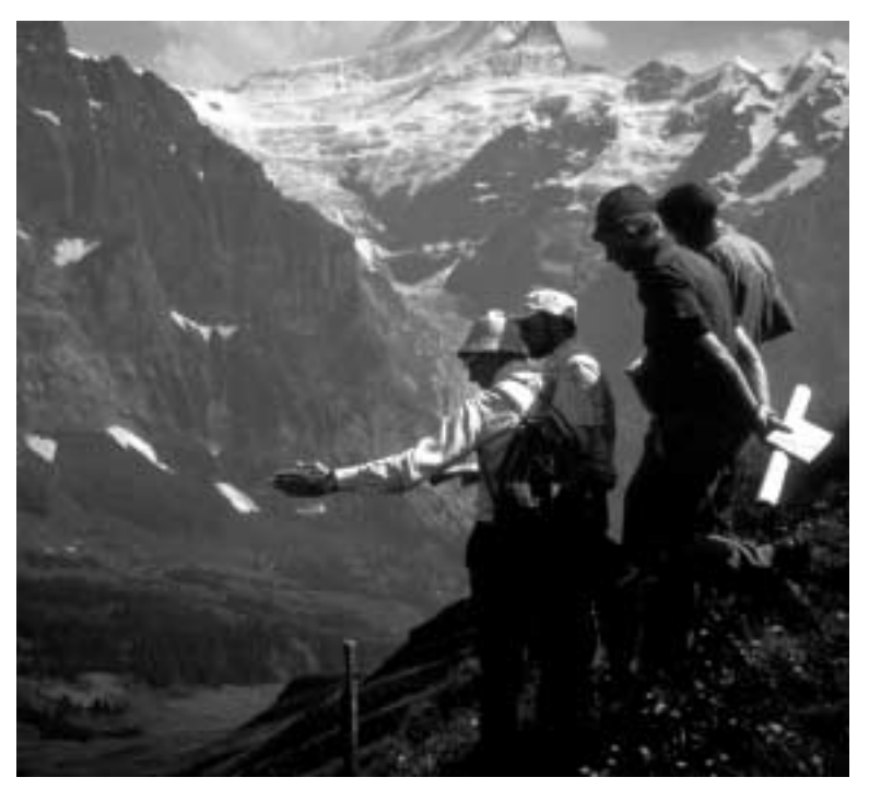
Monitoring glacial retreat in European Alps.