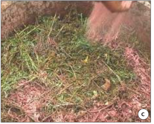
Rock phosphate powder sprinkled on organic material