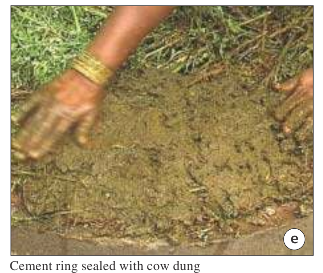
Figure 4(a–k). Vermicomposting process.