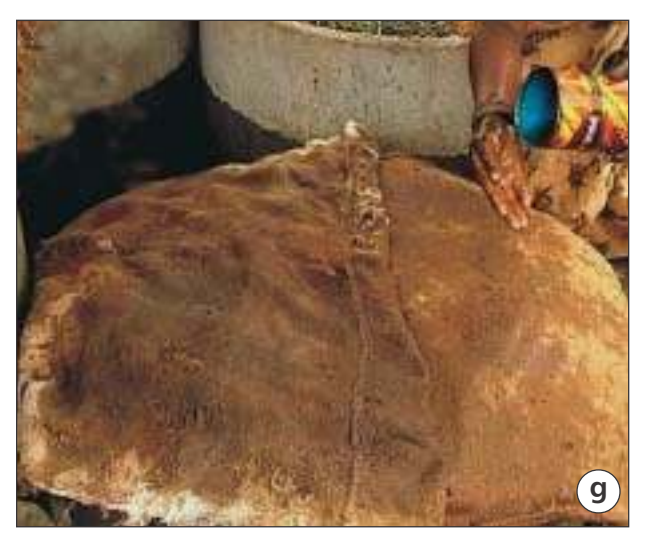
Cement ring covered with gunny bag