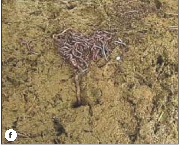
Earthworms are released near cracks