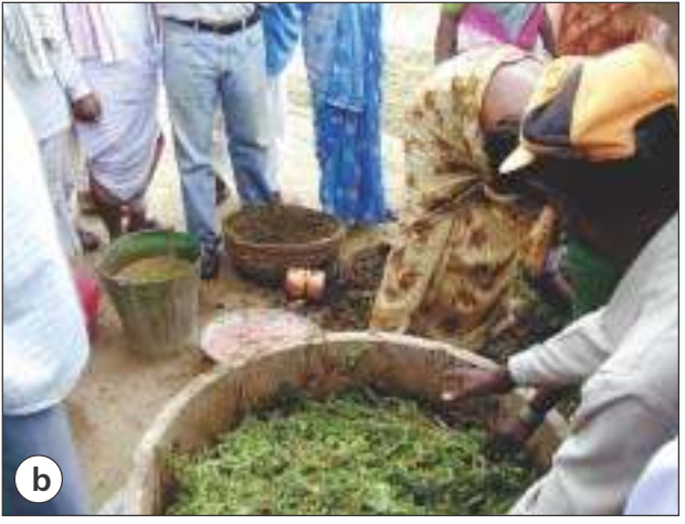
Layer of raw material placed on polythene sheet