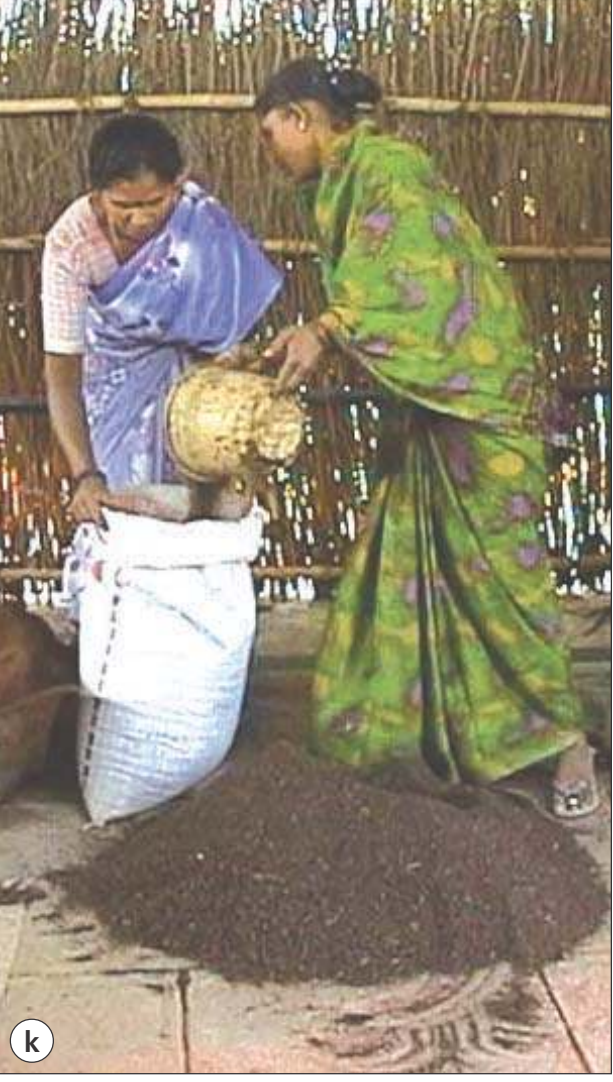
Bag filled with vermicompost