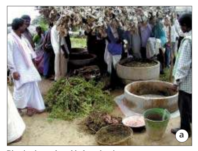
Plastic sheet placed below the ring