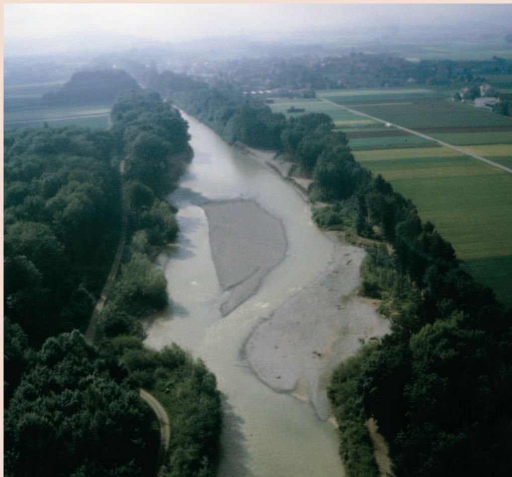
FIGURE 3 The result of a “Space for Rivers” initiative in Switzerland: the resilience of the Emme valley to flooding has been increased by allowing part of the Emme to return to its natural riverbed. This structural measure is cost-efficient, protects the river against undesired influx (thus improving water quality), helps conserve a natural ecosystem, and improves the quality of recreation areas. View of the Emme near Utzenstorf.

rather than certainties. Both the Netherlands and Switzerland offer good examples (“Space for Rivers” initiatives) of stakeholder-driven collaboration between society and scientists that is developing innovative approaches to flood hazards (Figure 3). Recognizing that engineered solutions cannot deliver full flood security, these programs allow experimentation with new policies and practices that increase society’s resilience to floods and