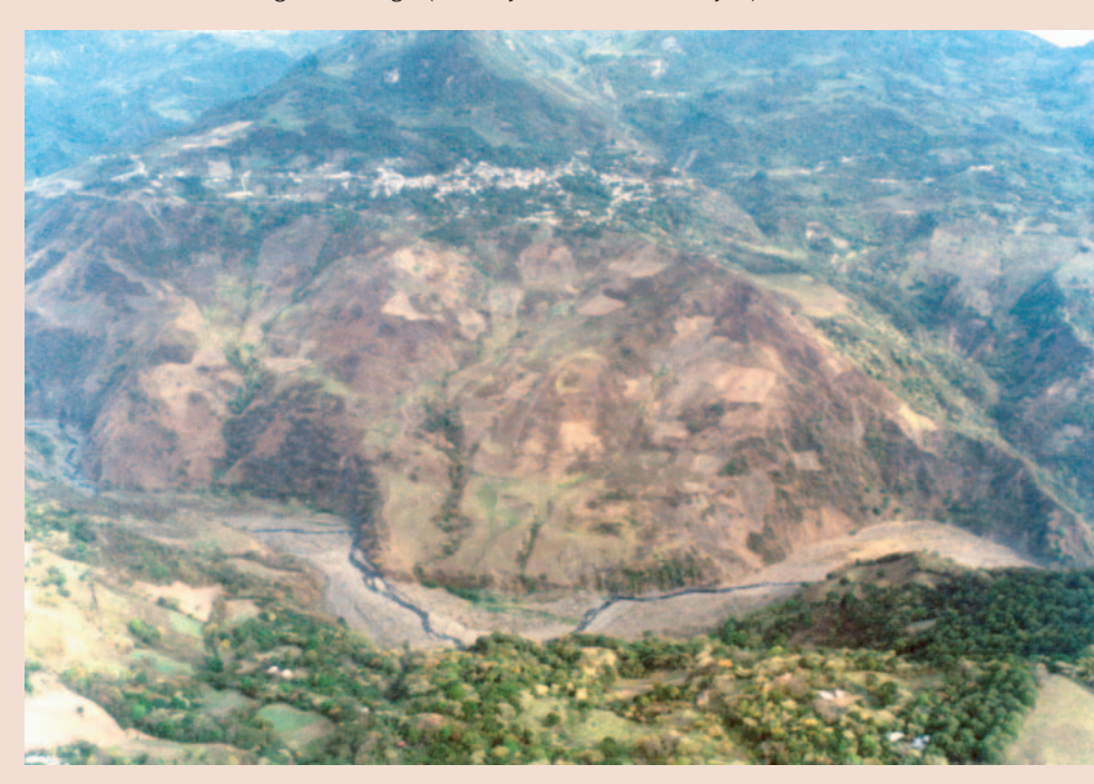
FIGURE 2 Several communities are located on slopes where landslides occurred long ago, and the risk of new landslides occurring remains high.