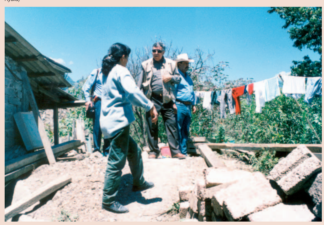
FIGURE 3 Involvement of local actors is a key to development of adequate strategies for disaster prevention. The high level of vulnerability of the local population is also reflected in poor housing conditions.

disaster processes in mountain areas in least favored countries is undoubtedly urgent. On the one hand, there is a lack of scientific research regarding instrumentation, monitoring and modeling in these areas, and a need to better understand the processes themselves, including the potential impact of extreme rainfall events and the role deforestation plays in soil hydrology. On the other hand, considerable further attention is needed to assess the vulnerability levels within communities. When conducting vulnerability research, it is crucial to consider factors such as social, economic, political and cultural issues, which ultimately determine the predisposition of the endangered communities to confront disasters.