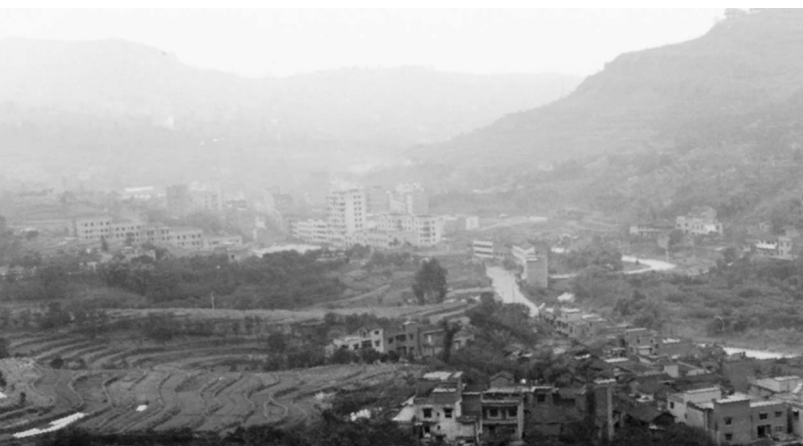
FIGURE 3 Changling Town area today: the village of Lishu, with a non-agricultural population of over 4600.