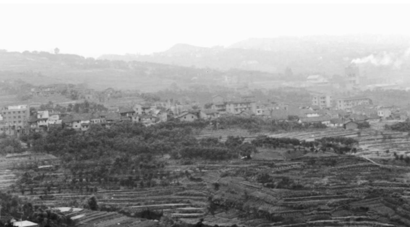
FIGURE 2 Changling Town area in 1994: the village of Fujia, with a non-agricultural population of only 620.

At present, most non-agricultural rural laborers are engaged in trade, services and construction, which require a relatively low level of skills. Laborers in non-agricultural sectors are usually self-employed or do casual work. Only about 20% of the laborers in the non-agricultural sector have stable wage labor. This illustrates that, although laborers are gradually shifting from the agricultural to the non-agricultural sector, employment is still in a period of transition.