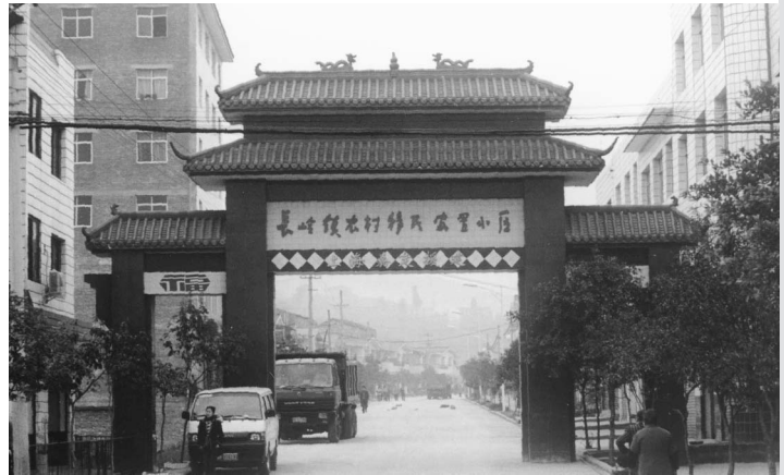
FIGURE 4 Rural migrant resettlement area in Changling Town.

transition of surplus rural laborers to the non-agricultural sector, several issues need to be addressed. First, in making policy decisions to promote urbanization, the foundations of the industrial sector should be fully considered. Consideration must be given to whether or not industry can provide enough jobs for rural laborers. Since the TGR area is now still in the initial stages of urbanization and many migrants need jobs, development of the industrial sector, especially in the TGR area, should be promoted in order to increase its capacity to absorb surplus rural labor. In the meantime, it will be necessary to enhance technical education in the area to improve the skills of rural laborers, especially women, so as to meet the demand of new industries for quality labor.