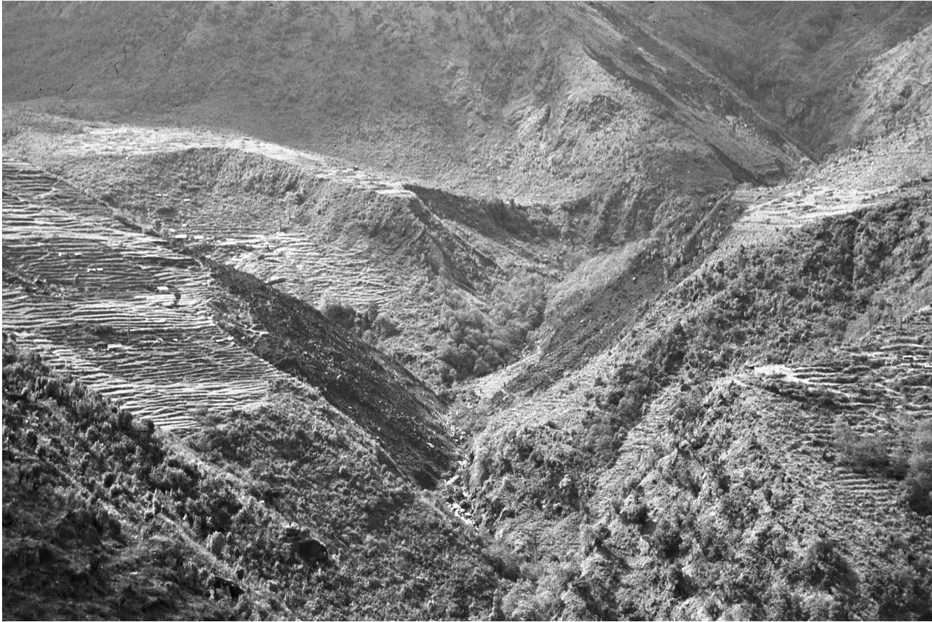
FIGURE 3 Forest near Lowagen affected by slash-and-burn maize cultivation. After harvesting maize, the cultivated field is usually abandoned. Recently, people have started cultivating chiraito ( Swertia spp.) with maize.

chiraito ( Swertia spp.) as cash crops. Dynamic changes in forest/agricultural lands in the Middle Mountains of Nepal are also discussed by Kollmair and Müller-Böker (2002). This important topic should be studied systematically in the future.