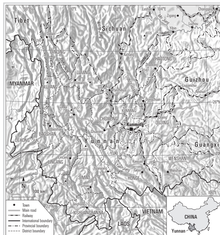
FIGURE 1 Map of Yunnan Province. (Map by Andreas Brodbeck)

The province of Yunnan is situated in southwest China. It covers an area of 394,000 km 2 . It neighbors Guizhou and Guangxi provinces in the east, Sichuan province in the north, and Tibet in the northwest, and has state borders with Myanmar in the west and southwest, as well as Laos and Vietnam in the south (Figure 1). Yunnan is a transition area between south China and the eastern Himalayas. In Yunnan, 3 major Asian climate zones come together: the tropical monsoon zone of South Asia, the subtropical monsoon zone of East Asia, and the Qinghai–Tibetan Plateau zone. This accounts for Yun-