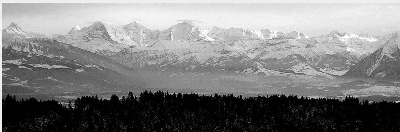
FIGURE 1 November snow on the Jungfrau–Aletsch–Bietschhorn World Heritage Site in Switzerland; view from the northwest.

UNESCO, Division of Ecological Sciences, Man and the Biosphere (MAB) Programme, 7 place de Fontenoy, 75532 Paris 07 SP France. t.schaaf@unesco.org