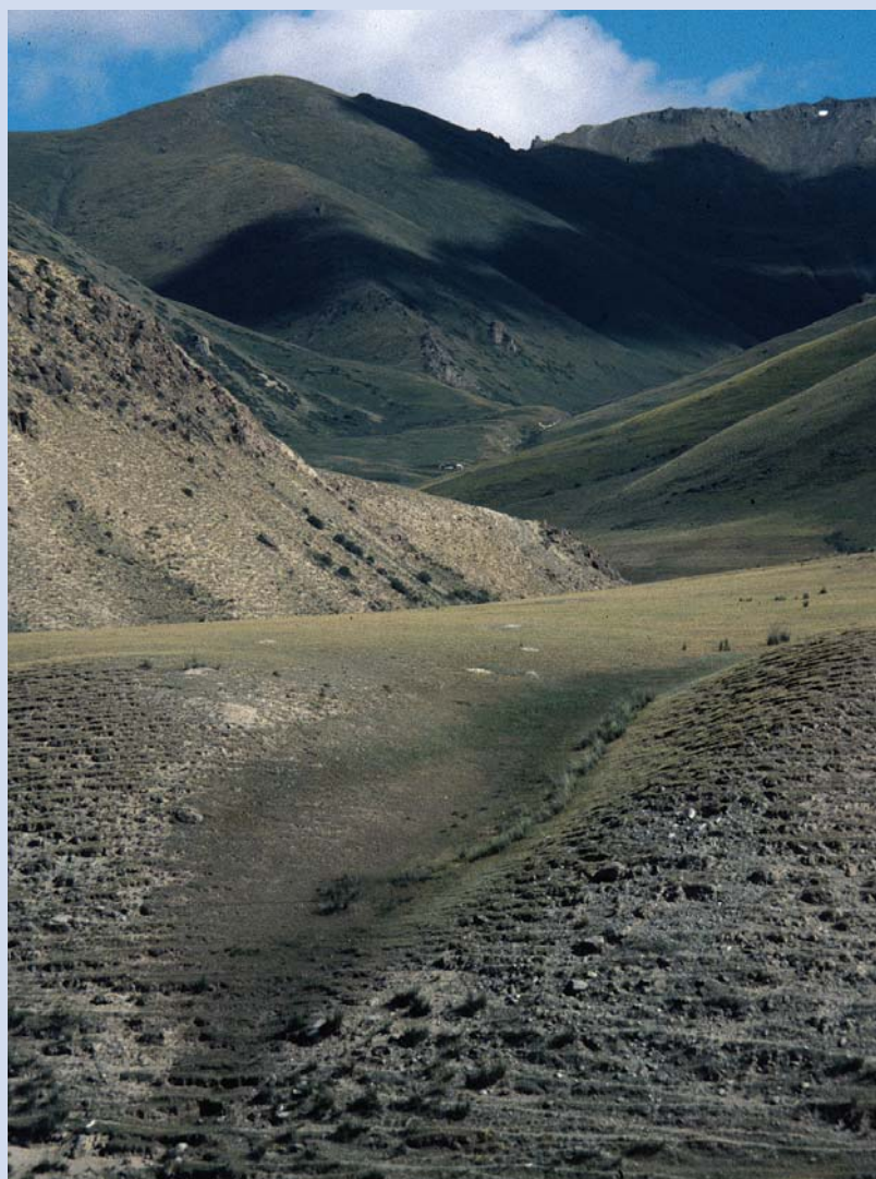
FIGURE 3 Degraded pastures near Tolok, Kyrgyzstan. Such signs of degradation are not a recent phenomenon but stem from Soviet times.

make use of available assets, including human resources, at the household level.