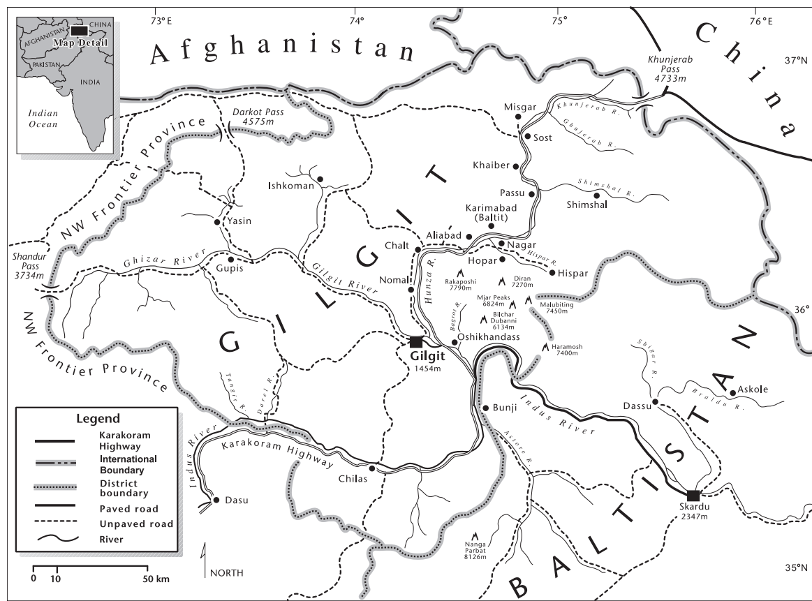
FIGURE 1 Map showing the location of the study area, District of Gilgit, Northern Pakistan.

nymys for all study participants quoted in this article to ensure the confidentiality of interviews and personal narratives.