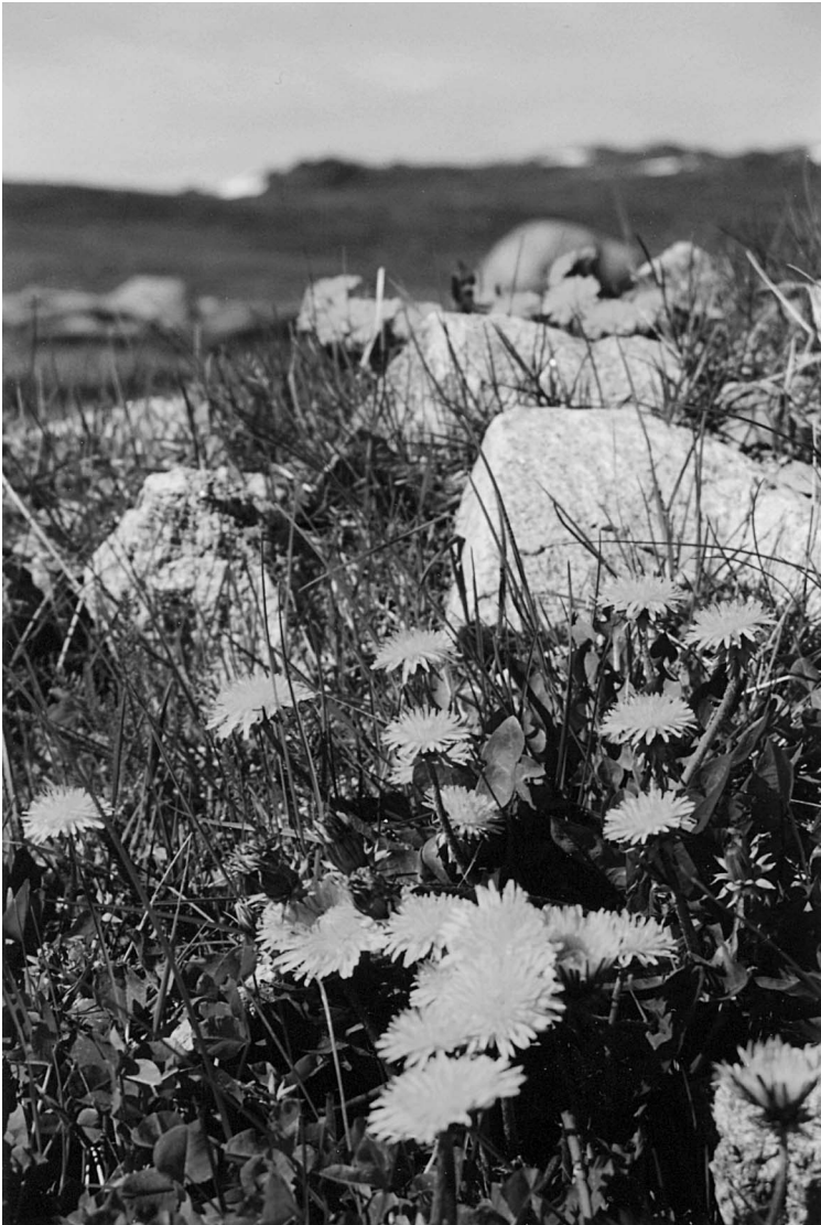
FIGURE 3 Dandelions ( Taraxacum officinale ) and clover ( Trifolium spp) growing along the edge of one of the gravel tracks near Mt Kosciuszko. Gravel track types often have a weed verge, whereas other track types, such as raised steel mesh walkways, do not provide weed habitat. Weeds are a problem in the alpine area; the diversity and abundance of weeds is likely to increase with predicted climate change.

water quality was feral animals, such as horses, pigs, foxes, cats, and in-stream trout introduced for recreational purposes. The impacts of feral fish on stream ecosystems are well recognized, with trout shown to reduce native fish populations within mountain creek systems in Australia (Cullen and Norris 1989; Green and Osborne 1994).