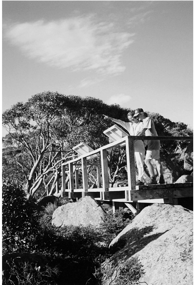
FIGURE 4 Sightseeing is the second most popular activity in the Kosciuszko alpine area. Lookouts such as this one at Charlotte's Pass provide visitors with interpretation and safety messages. This type of wooden structure protects the immediate environment from excessive trampling.

Norris 1999; Growcock 1999; AALC 2000; Buckley et al 2000). Changes in creek flow regimes as a result of snowmaking, snow grooming, and harvesting have been found, although most research is for mountain regions overseas (Good and Grenier 1994; Growcock 1999).