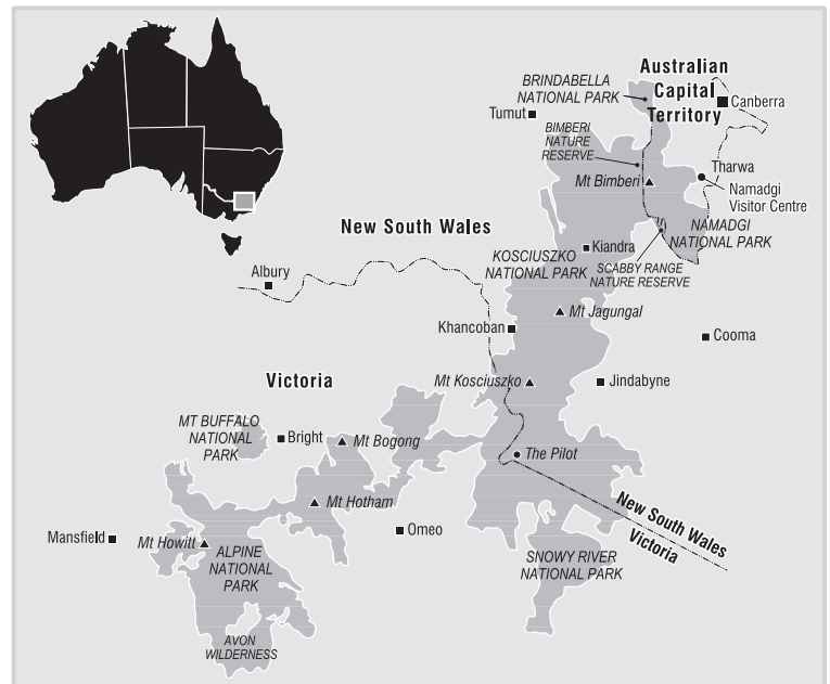
FIGURE 1 Australian Alps protected areas. Modified from AALC (1999).

Winter seasonal snow in Australia is restricted to the southeastern corner of the mainland and parts of Tasmania (Green and Osborne 1994). On the mainland, snow cover is regularly found only on a series of linked ranges and peaks known as the Australian Alps. The area is of outstanding biological importance, containing many endemic plants and animals as well as geological features of high conservation value (Mosley 1988). The protected area network of the Australian Alps includes Kosciuszko National Park, which contains the continent's highest mountain (Mt Kosciuszko, 2228 m), the entire alpine area, and most of the subalpine areas of New South Wales (Pulsford et al 2003). In Victoria, the high country is conserved in Alpine National Park, the Avon Wilderness, Snowy River National Park, and Mt Buffalo National Park (Figure 1; Pulsford et al 2003).