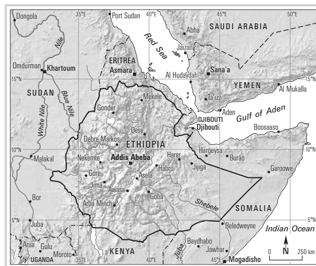
FIGURE 1 Map of Ethiopia. (Map by Andreas Brodbeck)

Khat ( Catha edulis ) is an evergreen tree grown for the production of leaves that are used as a stimulant. It can reach 25 m in height when grown naturally (Klinge 1998), but it is kept under manageable height when grown as a cash crop and for home consumption. The economically important products are its young leaves and tender twigs, which are chewed for their stimulating effect. Major areas of production and consumption are East Africa, southwest Arabia, and Madagascar (Pantelis et al 1989). Khat grows on well-drained soil under broad climatic conditions and tolerates drought for sev-