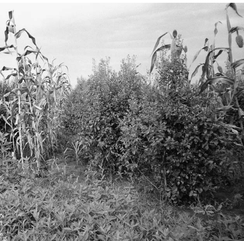
FIGURE 2 Intercropping of khat and sorghum.

the production is exported to Djibouti and Somalia, but the bulk of it is marketed and consumed within the country, mostly in the Somali administrative region (Green 1999). In 1998–1999, khat accounted for 13.4% of Ethiopia's export earnings and was the country's second largest export item that year (US Department of Commerce 2000). Although national data are lacking, the Ethiopian government collects huge revenues from the export taxation of khat. According to the west Hararghie finance office, export khat is taxed at 6 birr/kg, whereas khat consumed locally is taxed at 3 birr/kg. This level of export tax was also confirmed in a study by the US Embassy (2001). The price of khat fluctuates seasonally according to the quality and amount supplied. Khat exporters state that the farm gate price of export quality khat to Djibouti is 8–30 birr (US$0.97–3.62) per kg, whereas that supplied to Jijiga is 3–7 birr (US$0.36–0.85) per kg. The price of khat is higher in the dry periods than during the rainy season, from April to September, when the supply is abundant.