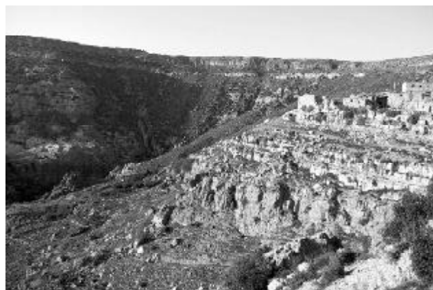
The natural beauty of Dana Reserve, April 2002.