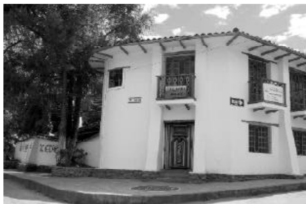
A gorgeous adobe building, decorated with mosaics and paintings and built around the trunk of a huge tree that had been deposited by the flood. La Casa del Pueblo was collectively built and now hosts all sorts of services for the people.

of the municipality, headed by the Mayor. This solved my last question, which regarded the interaction between this novel, participatory and rather spontaneous form of governance and the "representative democracy" governance system.