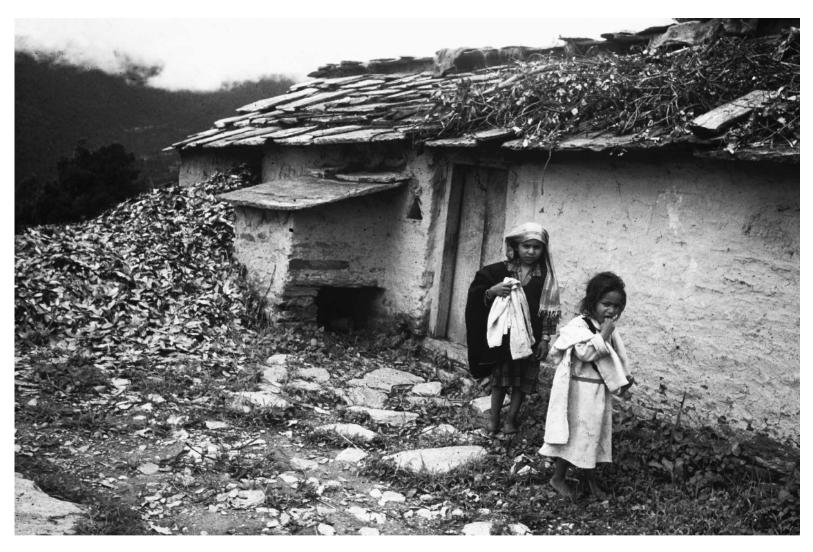
FIGURE 3 A heap of manure outside a livestock shed. Leaf litter from the forest is used as bedding material in such sheds, and the mixture of litter and animal excreta is used as manure in fields. Higher manure input to sustain cash crops results in more intense litter removal from forests.

Himalaya), began cultivation of many costly medicinal plants that used to be harvested from the wild, thus generating income without any significant loss of food crop diversity (Maikhuri et al 2000).