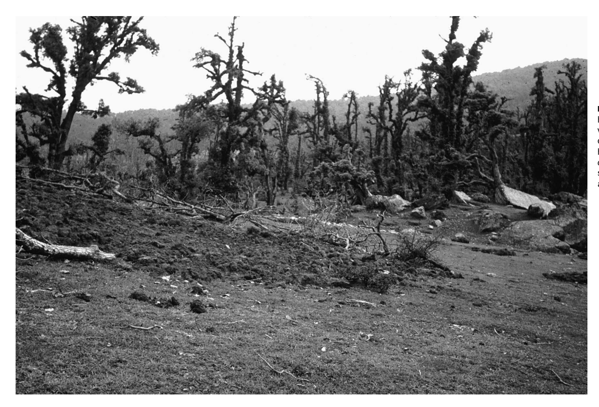
FIGURE 2 Trees in forests are heavily lopped, resulting in conversion of dense to open forests over time. The photo shows heavily lopped oak trees ( Quercus leucotrichophora ) and expansion of cultivation in an open area.