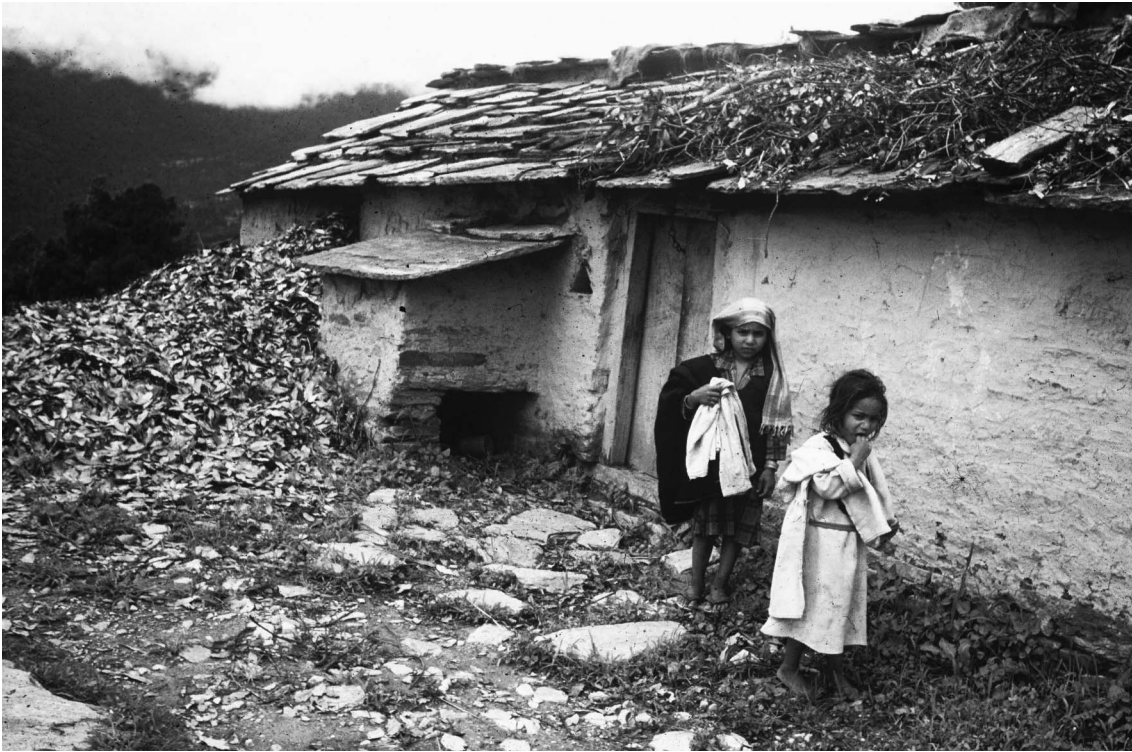
FIGURE 3 A heap of manure outside a livestock shed. Leaf litter from the forest is used as bedding material in such sheds, and the mixture of litter and animal excreta is used as manure in fields. Higher manure input to sustain cash crops results in more intense litter removal from forests.

Himalaya), began cultivation of many costly medicinal plants that used to be harvested from the wild, thus generating income without any significant loss of food crop diversity (Maikhuri et al 2000).