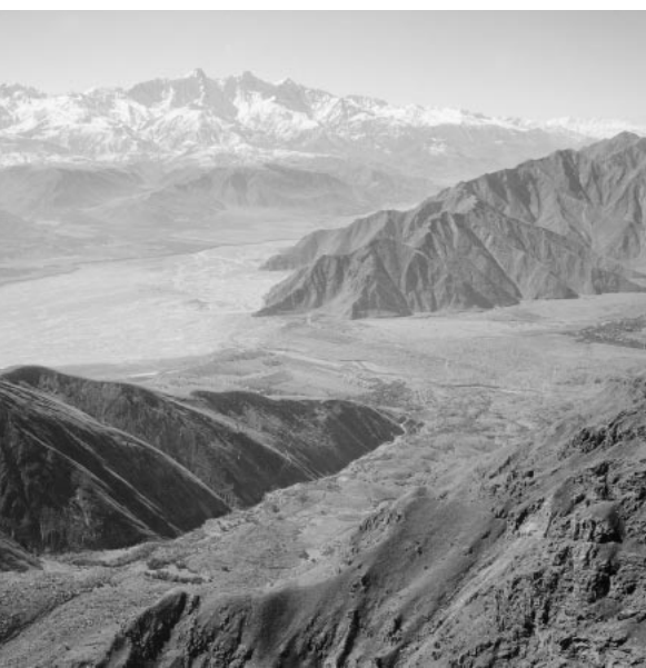
FIGURE 2 Aerial view of the lower Surkhob Valley in the Tajikistan Pamir. The valley floor, from the bottom left almost as far as the main river, is buried under the rock debris that resulted from a massive rockfall and landslide triggered by the major earthquake of 1949. The rock debris covers the former site of Khait, the regional administrative center.

occurrence of large landslides, for instance, that blocked valleys and dammed up ephemeral lakes. Subsequently, some of these lakes must have drained catastrophically. One of the more recent of the landslide lakes is Lake Sarez. It originated following an earthquake that occurred during the winter of 1911 and today is more than 60 km in length and over 500 m deep (Alford et al 2000).