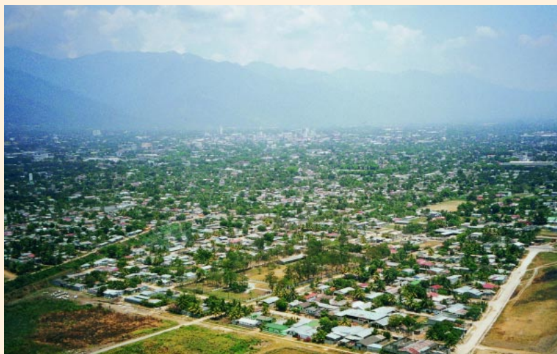
FIGURE 4 View of the Sula Valley 1½ years after Hurricane Mitch, showing the city of San Pedro Sula in the background. The densely settled valley was directly in the path of the discharge that flowed down the Comayagua River in the wake of the hurricane.

While detailed official calculations have not yet been made, it can be stated that El Cajon had two main impacts on the floods caused by Hurricane Mitch: a delay of discharge and a very substantial reduction of peak discharge. If the 600 million m 3 of water retained by the reservoir had gone downstream in addition to what flowed down the valley and if peak discharges had not been greatly reduced, the flood would have inflicted much more serious damage than what was observed, especially in the densely populated Sula Valley. However, the mitigating role of El Cajon was enhanced by the exceptionally low dam filling level in October 1998. With normal water levels, maximum discharge and discharge volumes would have been greater. The possibility that the central part of Honduras, and hence the El Cajon watershed, will be struck again by strong hurricanes in the future cannot be ruled out, especially in light of climate change, which could increase hurricane frequency in this part of the country. Considering this possibility, what are the options for reducing the risk of downstream destruction? The following is a short overview of these options and the role the dam could play in helping prevent disasters in the future.