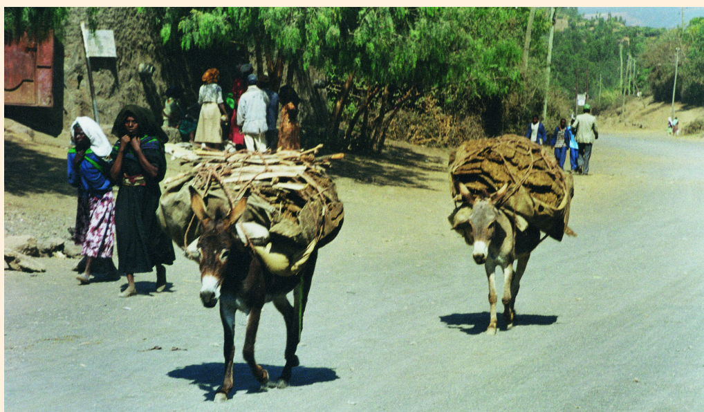
FIGURE 4 Dung is a marketable commodity and is used domestically as a substitute for firewood instead of being spread as fertilizer to compensate for soil nutrient depletion.

“We used to have community rules that governed land use and even helped to protect trees and water resources. That was before the Derg (communist regime) and democracy.” (Abraham Eidye, an Ethiopian farmer)