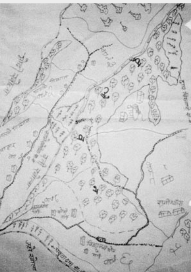
A participatory sketch map of Thulosalgari forest produced by the men and women of Pakuwa VDC Ward 8.