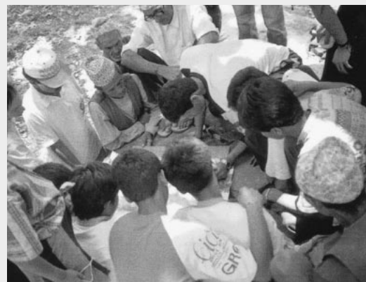
Members of Pakuwa VDC Ward 7 produce a participatory photomap for Thulosalgari Forest.