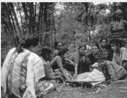
A group of women from Pakuwa VDC Ward 6 use a large-scale photographic enlargement to discuss the use of Thulosalgari forest and the impacts of grazing on forest condition.