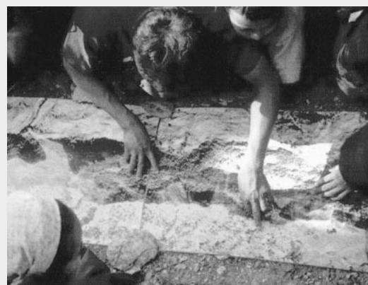
Men and women from Wards 6, 7, and 8 of Pipul Tari VDC use a very large-scale enlargement (1:1250) to identify users and usage of Akhori Pakho Forest.

allows system operators to treat all the many fragments of image as if they were a single photomap. Other advanced features of the photomap system include automatic image-database management/compression with automated map scaling and map formatting and compatibility with ArcView® vector formats and overall ease of system use.