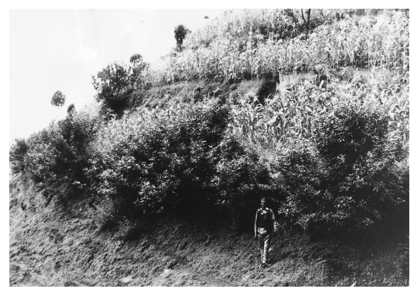
FIGURE 2 Cultivation of timur on terrace risers on private lands.

germination. Timur can also be propagated vegetatively from branch cuttings or seeds. Timur flowers regularly around April to May and produces constant fruit yields over the years. However, hailstorms in spring can destroy the flowers.