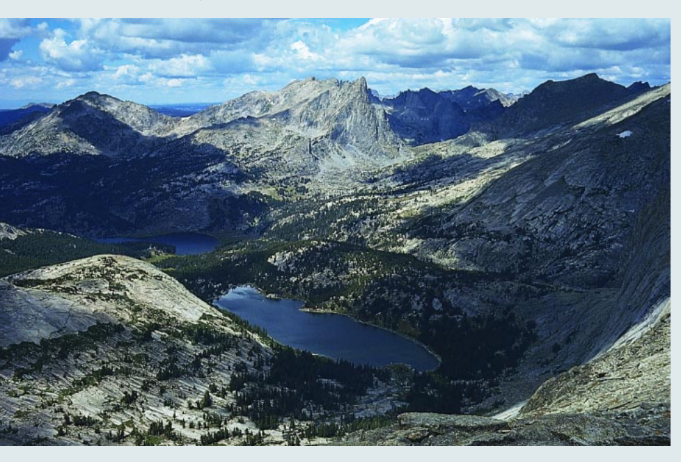
FIGURE 2 Bunion Creek Allotment, looking north toward Cirque of Towers. As in most of the intermountain West, the forest is only low-value lodgepole pine and slow-growing spruce and fir.