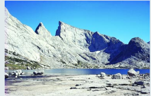
FIGURE 4 Deep Lake, East Temple, and Steeple Peaks, an area most attractive to climbers.

But climbers and other visitors to the Bridger Wilderness, drawn to Deep Lake by the promise of wildness and solitude expected in federally designated Wilderness, are appalled and disgusted when they meet 2000 bleating sheep. Although the Wilderness Act of 1964 permits domestic livestock to graze in Wilderness areas, this politically mandated concession to the livestock industry was bitterly resisted and remains controversial. Widespread among environmentalists since John Muir is the unshakable conviction that