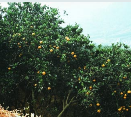
FIGURE 7 Orange plantation near Jishou in the Tujia Nationality's Prefecture in Hunan Province. Focusing exclusively on oranges in the area has led to overproduction and a waste of resources. Market analysis is needed to adapt to new economic conditions.

Group and the Xiangquan Group, whose businesses involve not only food but also other products such as medicine.