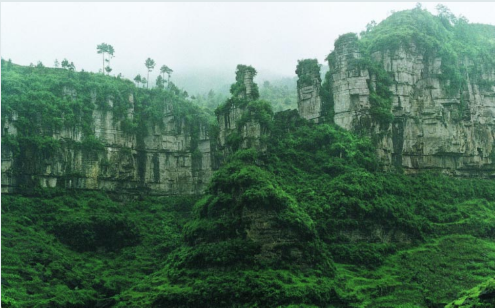
FIGURE 9 Jinfoshan (the Gold Buddha Mountain) in Nanchuan County, Chongqing Municipality, is a spectacular tourist attraction.

ucts. Further development will depend on market expansion.