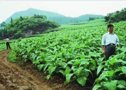
FIGURE 4 Tobacco is a major cash crop in Dejiang County, Guizhou Province.

Increased yields and the development of food processing plants as well as an increase in disaster-free farmland (from 0.2 ha per capita in 1989 to 0.34 ha in 1996) permitted major progress in the struggle against poverty. Infrastructure has also improved significantly: over 90% of towns and villages now have access to electricity, telephone services, and roads. But poverty has not been eradicated, and many new demands and problems have arisen in the past 10 years. Raising the standard of living has become an important new objective, but it is questionable whether the path taken in other parts of China to reach this goal is the right one for this mountain region.