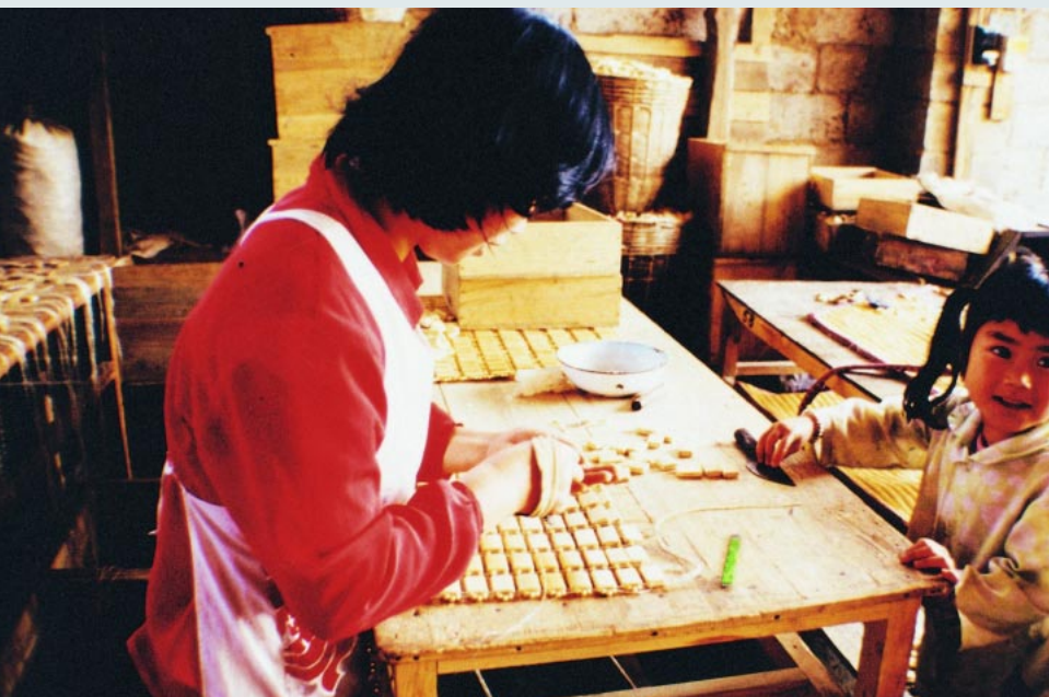
FIGURE 8 Local arts and crafts could become the source of new income in the tourist sector. Production of bamboo articles in Yanhe County, Guizhou Province.

The industrial sector should focus on enhanced management of advantageous products. The machinery industry should be given priority, with a focus on automobiles, tractors, motorcycles and motorcycle parts, engines, and inland river ships. The food industry, high-performance cement for building dikes and roads, and decorating and ceramic materials are also important. Paper slurry could be developed using local raw materials. Industrial development must focus on variety, high quality, and mass production as well as on the market.