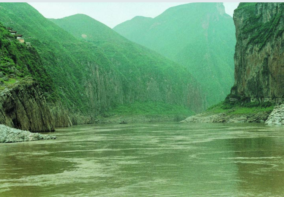
FIGURE 3 The famous Three Gorges of the Yangtze River are a well-known tourist attraction.

domestic product (GDP) in 1998 was only 1.53% of the overall Chinese GDP.