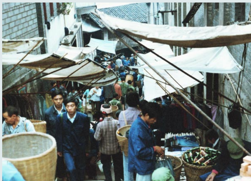
FIGURE 5 A rural market that is adapting to the new market economy (Fuling District, Chongqing Municipality).

Industrial development is currently at a preliminary stage. Future goals should include intensification of agriculture, with large-scale agricultural production of cash crops and livestock; flexibility in the rural