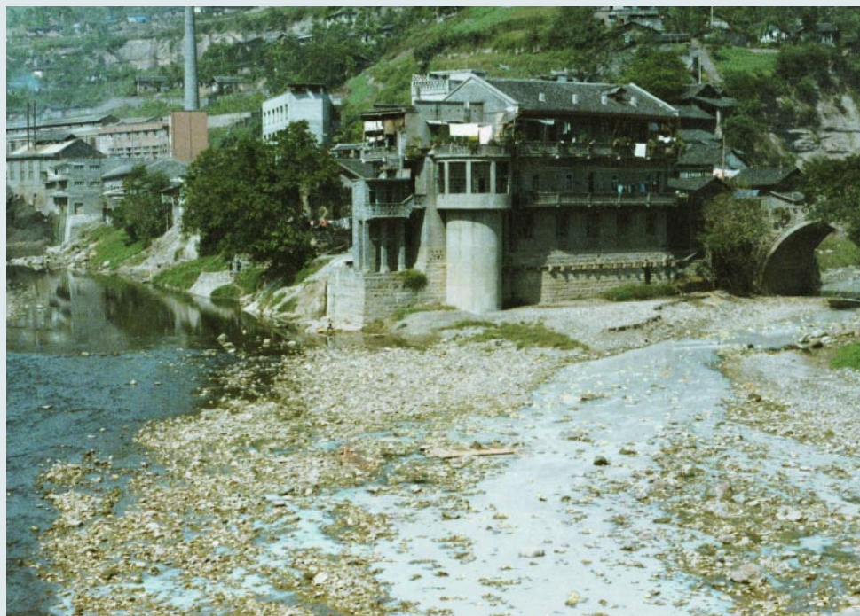
FIGURE 6 Polluted river in Wanzhou District, Chongqing Municipality.

Backbone industries must be defined according to new principles: the focus should be transferred from previous departments of industry and trade to industrial groups and products that are profitable and competitive. For example, making the food industry a backbone of the economy should no longer be a goal. Support should be given to internationally competitive enterprises such as the Maotai