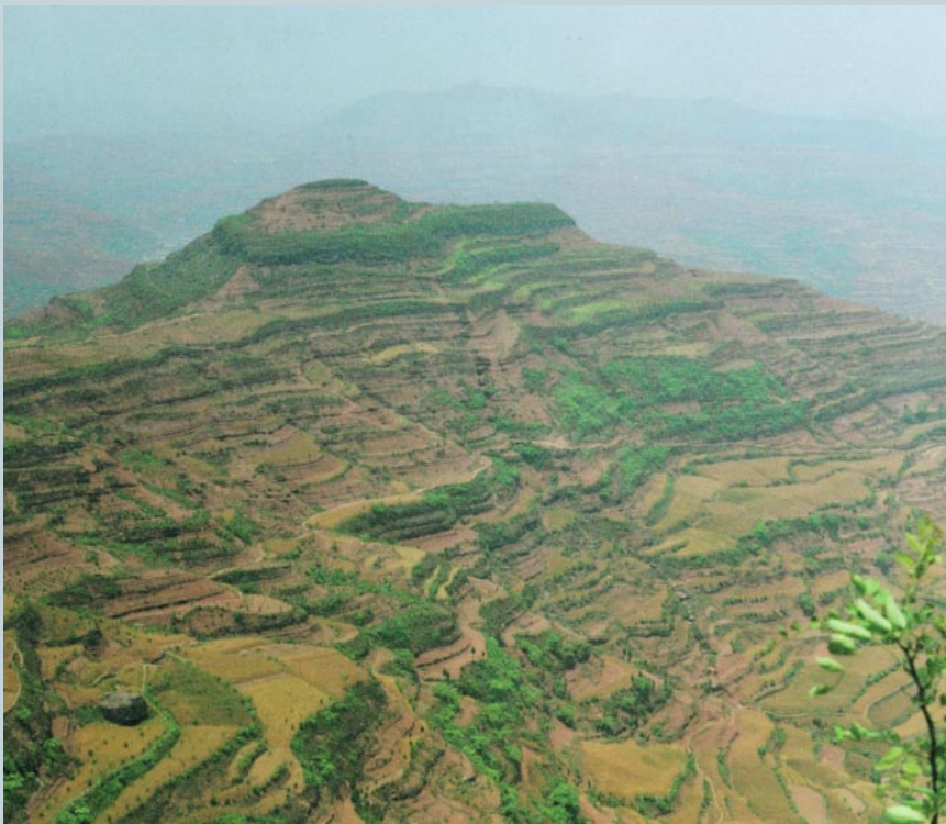
FIGURE 1 Yingyang County in Chongqing Municipality: cultivation on steep hills causes erosion.

There is also a need to raise awareness of the requirements for sustainable development strategies in mountain areas. This will involve industrialization of agriculture, increasing the quality of products in the primary and secondary sectors, developing the service sector, improving infrastructure for transport and trade, and letting the market determine resource use rather than vice versa. The following introduction to the region and its problems is complemented by recommendations for enhancement of economic strategies in the mountain areas shared by Chongqing Municipality and the provinces of Hubei, Hunan, and Guizhou and linked by the Yangtze and its tributaries.