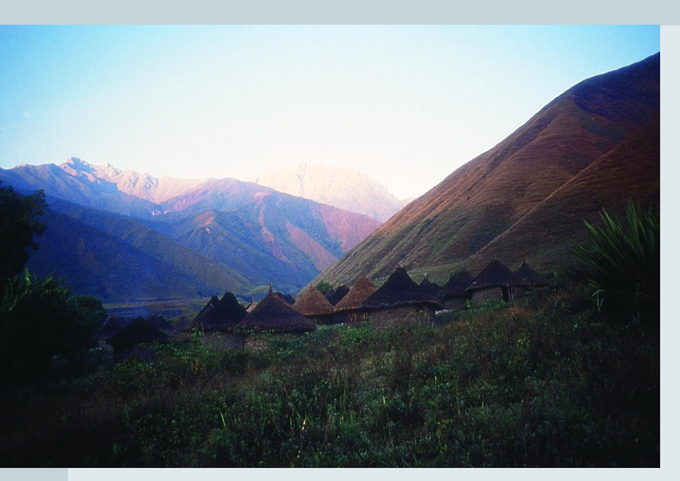
FIGURE 1 Indigenous village in the Sierra Nevada de Santa Marta. Working landscapes such as this require innovative approaches to conservation.

and requires new and innovative approaches to conservation. Emerging trends in conservation and protected areas management are creating new opportunities to engage local people in the stewardship of the natural and cultural heritage of working landscapes. This type of community-based approach builds on years of experience yet extends conservation strategies in new ways and holds great promise as a foundation for sustainable land stewardship.