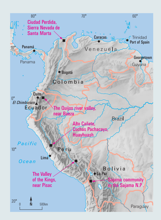
FIGURE 4 Location of 5 study sites on which the Ruta Condór/Wiracocha project draws in its attempt to link culturally and biologically important areas along the Andes. See also the article by Fausto Sarmiento et al., "Andean stewardship: Tradition linking nature and culture in Protected Landscapes of the Andes" in a special issue of The George Wright Forum (vol. 17.1, 2000). (Map by Andreas Brodbeck)

These sites, many of which are within or near currently protected areas, include examples of indigenous management, traditional agriculture, sacred sites, ecotourism, and production alternatives. Each of these sites is rich in cultural and natural values and can be sustained only through the stewardship of local and indigenous communities (Figure 5). Over time, it is envisioned that the scope of the project will be expanded to encompass other cultural landscapes in Venezuela, Peru, Ecuador, and Chile. The Ruta Cóndor/Wiracocha project offers great potential to support the stewardship of Andean landscapes on a regional basis.