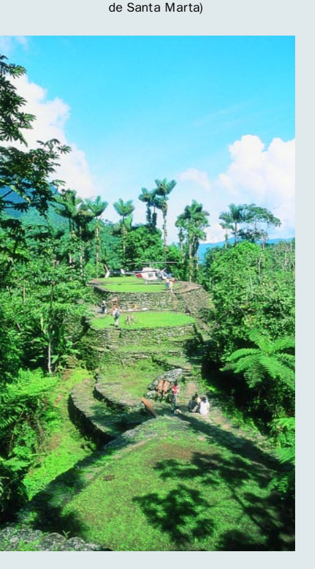
FIGURE 3 Ciudad Perdida, one of 300 archeological sites in the Sierra Nevada de Santa Marta, Colombia, offers an example of how human activity over time has shaped the landscape.

Experience with protected landscape conservation has also demonstrated that working with local communities is a critical component in the conservation strategy. The protected landscape approach has proven to work well in certain indigenous territories where strictly protected areas have failed, because it reinforces local responsibility for the area and accommodates traditional uses and customary tools for resource management. This can be of great importance in Andean countries, where the cultural landscapes provide evidence of the sophisticated systems of agriculture developed by indigenous societies to increase productivity in that complex environment. As Mujica argues, sustaining and restoring these cultural landscapes can therefore offer important opportunities for sustainable development of indigenous societies.