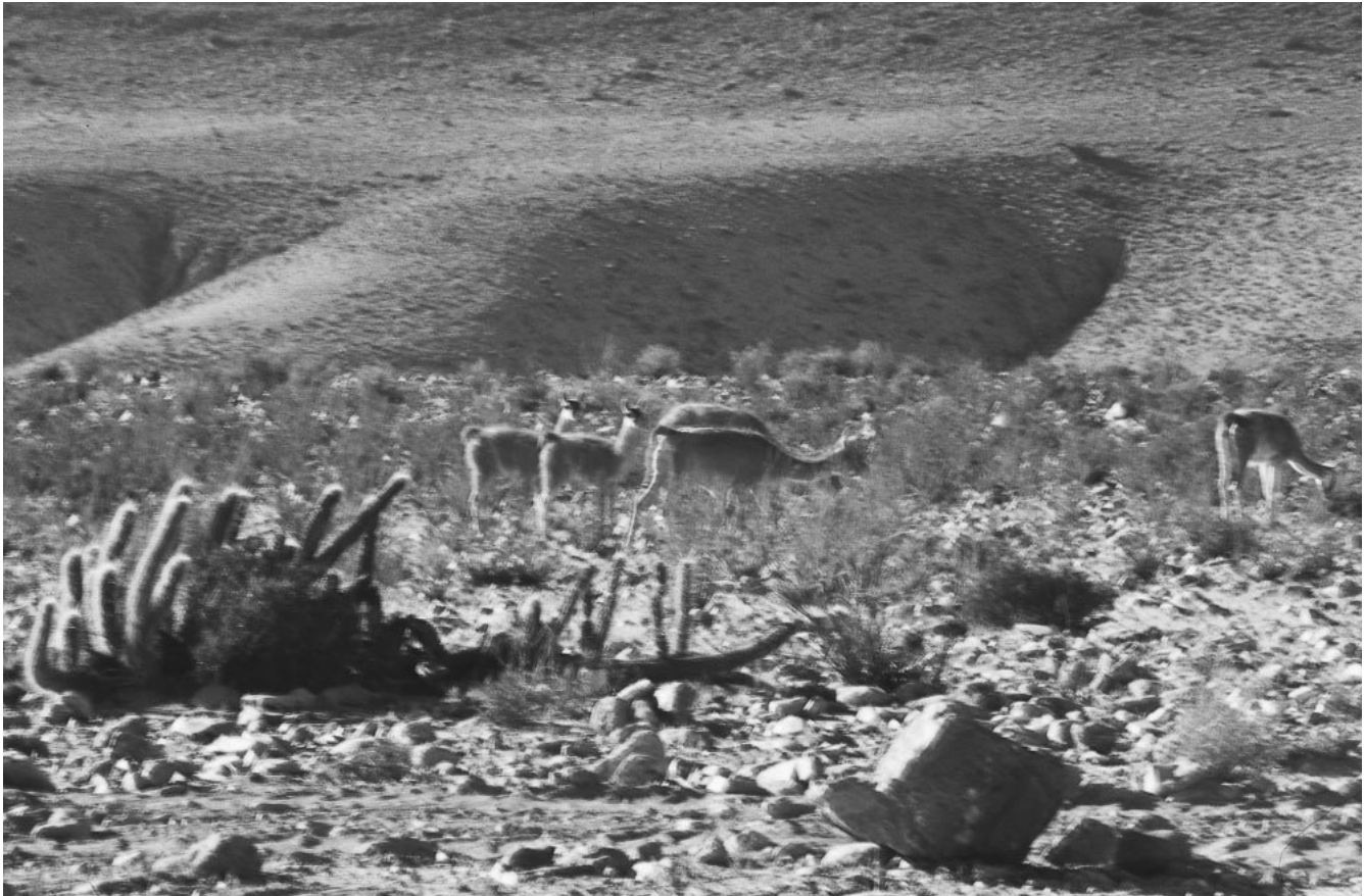
FIGURE 6 Grazing guanacos in pre-puna shrubland about 30 km southwest of Putre, outside of Lauca National Park. This habitat is poorly represented within the park.

leading to the creation of Las Vicuñas National Reserve adjacent to Lauca as an area where more active management can take place. Careful consideration is now being given to how herds of vicunas can be managed so that an industry can be developed by indigenous populations to harvest valuable vicuña fur in a sustainable manner and without violating the restrictions of CITES for this endangered species. Management and protection of Andean huemul, guanacos, and a variety of rare plant species in prepuna habitats can best be implemented by adding larger areas of these habitats to the existing park (Figure 6). This issue is discussed in more detail below.