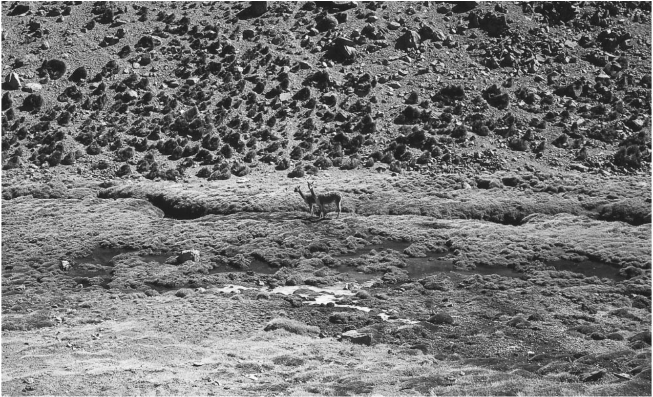
FIGURE 4 Grazing vicuñas on one of the roadside bofedales near Las Cuevas in Lauca National Park. The rocky hillside slopes behind are dominated by perennial bunchgrasses, particularly Festuca orthophylla and Deyeuxia breviaristata .