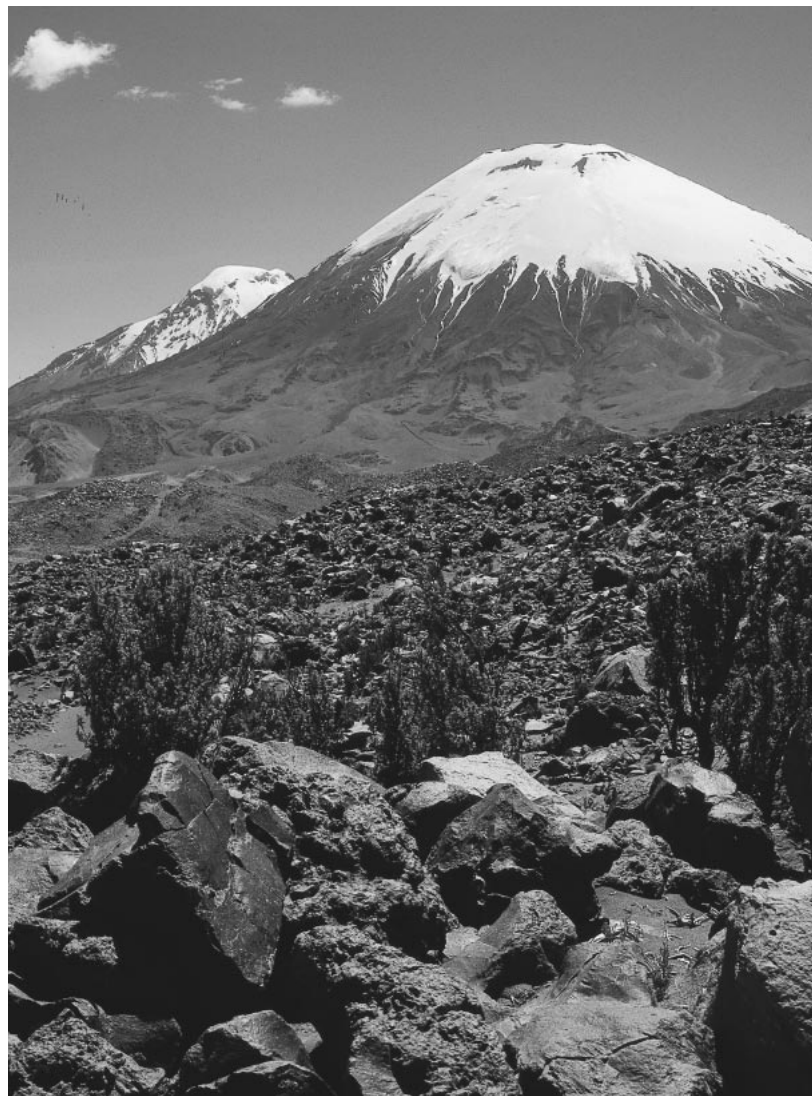
FIGURE 3 Volcán Ponerape (6240 m, left) and Volcán Parinacota (6342 m, right) tower over rocky lava ridges with stands of Polylepis tarapacana growing with Parastrephia lucida and Azorella compacta .

The biogeographic affinities represented in the flora of Lauca National Park and adjacent areas of Parinacota Province show differing patterns between zonal and wetland floras. The flora of zonal habitats of the prepuna and puna show stronger floristic links to a regional puna flora extending from southern Peru and western Bolivia into northern Chile and Argentina. This puna flora in the Andean puna habitats of northern Chile is markedly distinct from that of the Andean flora characteristic of the central and south-central Andes, where winter rainfall regimes exist (Arroyo et al 1988). There is a stronger floristic similarity, however, between the puna wetland flora of northern Chile and the Andean wetland flora of central and southern Chile, and little local endemism is present in this group (Arroyo et al 1982, 1988; Ruthsatz 1993).