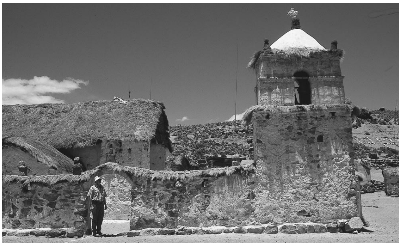
FIGURE 5 Village of Parinacota at 4400 m elevation in Lauca National Park. The church was originally constructed by the Spanish conquistadors in the 17th century, and rebuilt in 1789.

Human history in the Lauca region of Parinacota Province extends back thousands of years. Hunter-gatherers are thought to have inhabited this region at least 7000 years ago and perhaps as far back as 10,000 BP. Agricultural and herding centers began to develop