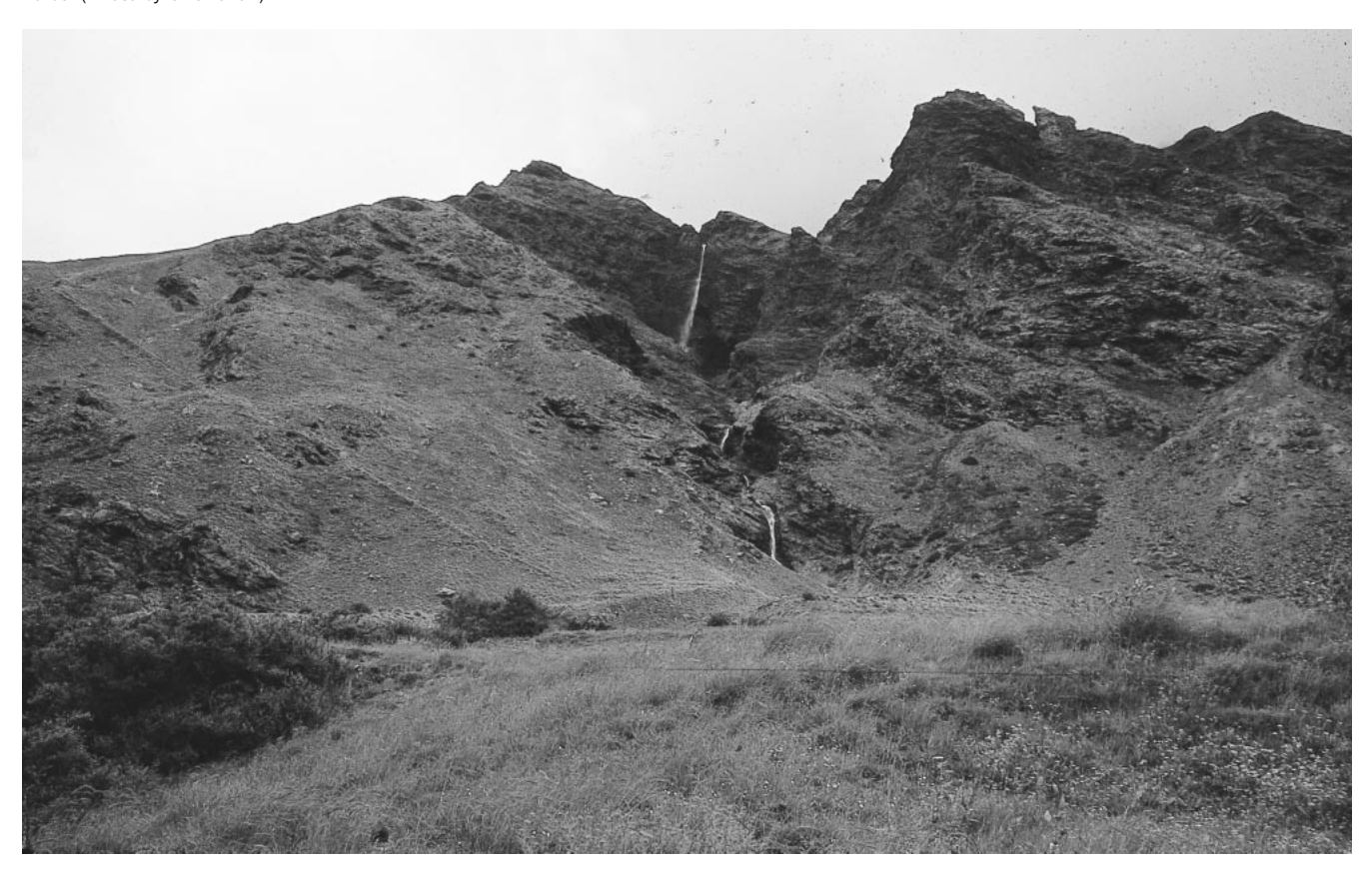
FIGURE 2 Alpine meadows above the timberline contain a great variety of flowering plants, including medicinal herbs.

Recently, rearing sheep and goats, practicing agriculture on marginal lands, and the production and sale of woolen articles have been major occupations among the Bhotiya .