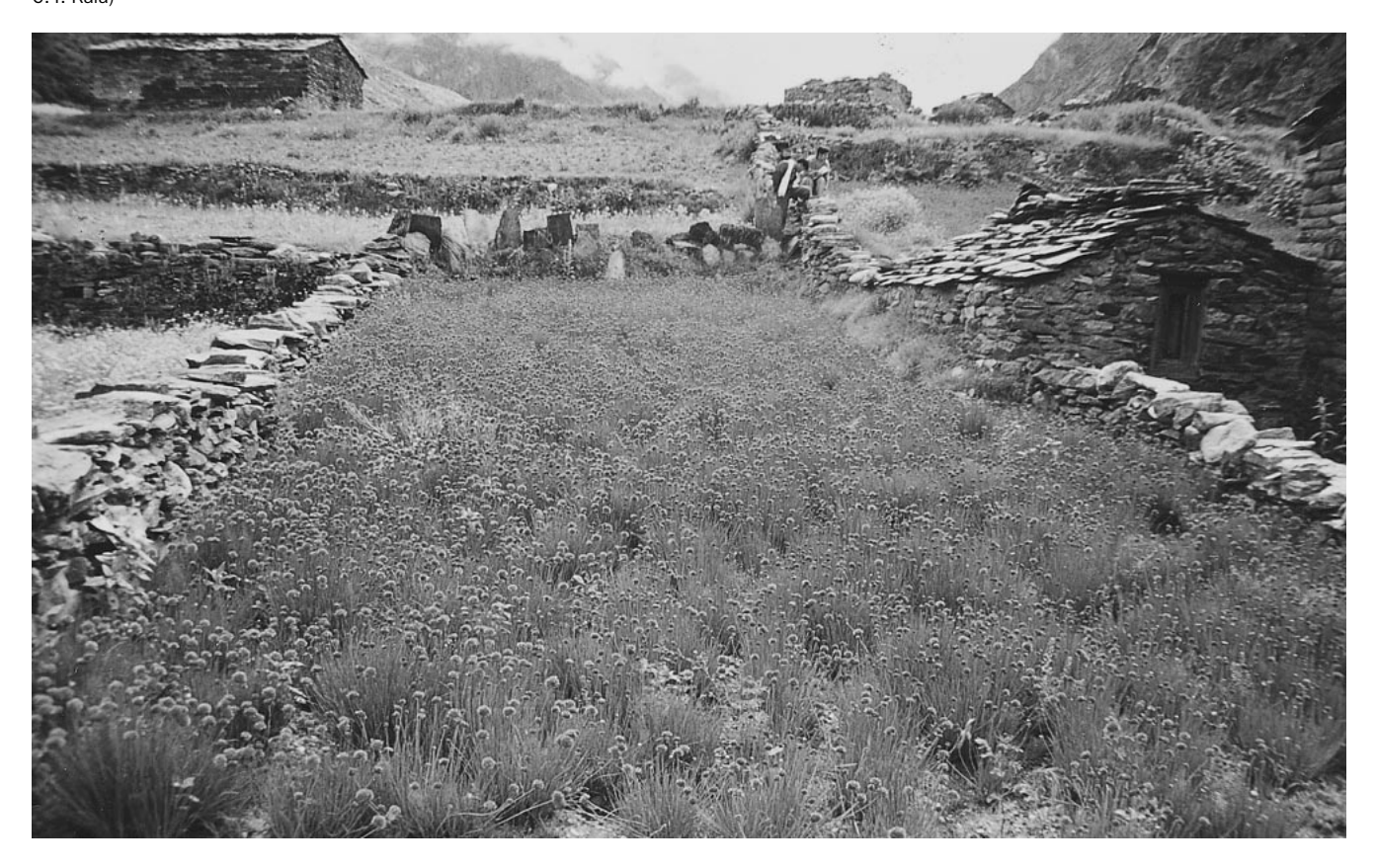
FIGURE 3 Cultivation of Pharan (Allium carolinianum) on an agricultural field.

centuries (Atkinson 1882). They are propagated through bulbs and their leaves are harvested twice a year, during June–July and September–October. However, the commercial cultivation of medicinal herbs in the villages studied is a relatively recent development that began about 5 years ago.